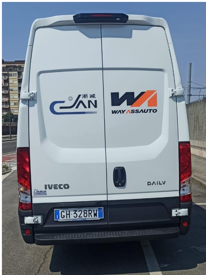
Graphics installed on the back.