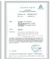
CE-LVD 230V Rope Light