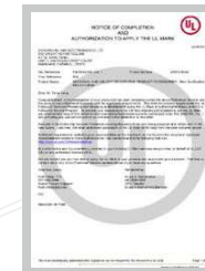
UL for LED Bulbs