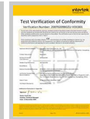
CE-LVD 230V Neon Light