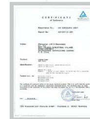
CE 24V Rope Light