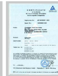
CE-EMC 230V Rope Light