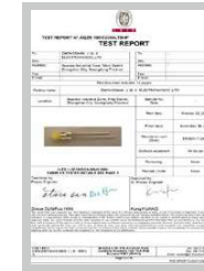
EN 62471 for LED Bulbs