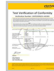
CE-EMC 230V Neon Light