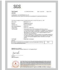
SVHC for LED Bulbs