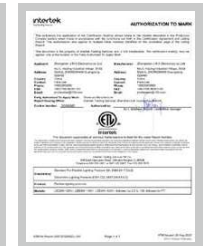
ETL Rope Light