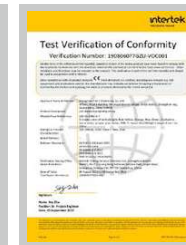
CE-EMC 230V String Light