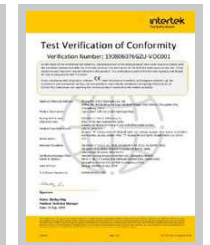
CE-LVD 230V String Light