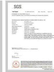
RoHS for LED Bulbs