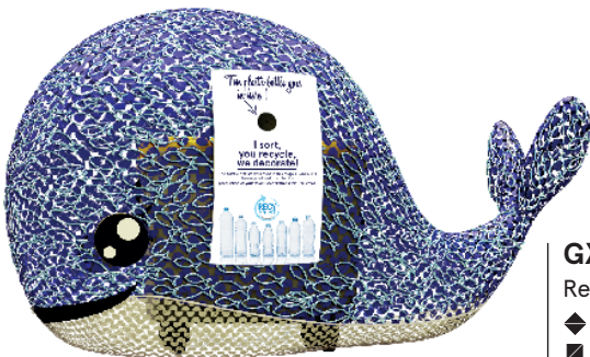
GX107-UK Recy Whale ◆ 2,30m - ◆ 3,70m ■ 2,10m - ☒ 86kg

Each decoration features communication, making the public more aware of recycling by highlighting the goal: To create illuminations for Christmas thanks to the bottles!