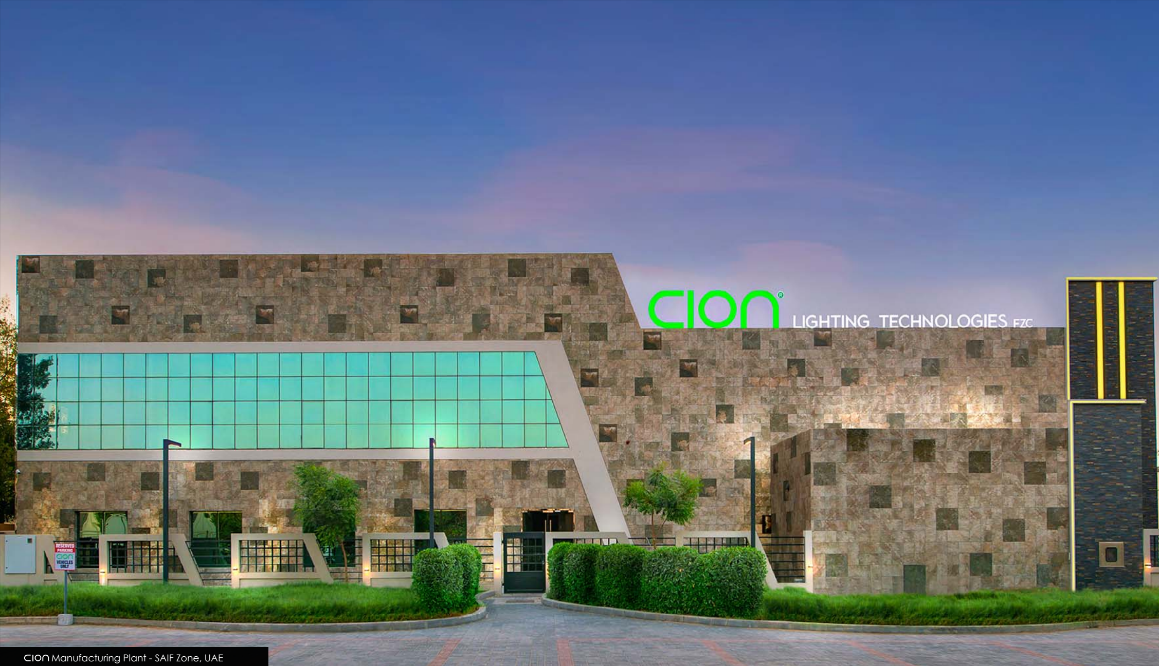
CION Manufacturing Plant - SAIF Zone, UAE