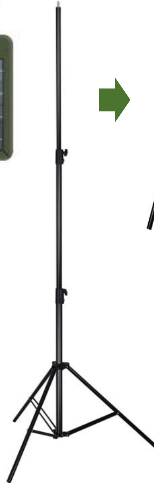
The tripod can be extended to 1.9m