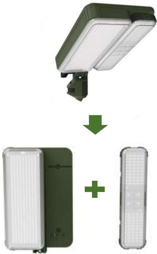
Portable/Multiple Combination Mode