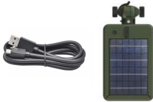
USB Charging / Solar Charging