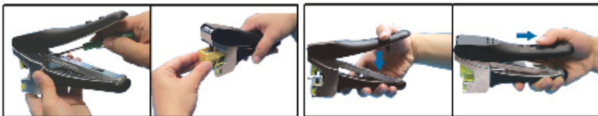
Exchangeable Cutting Module