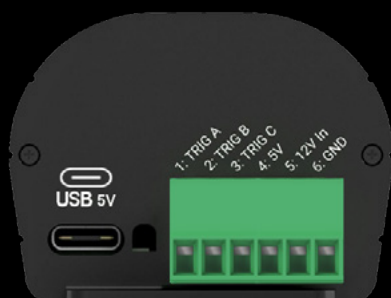
CLUB 512 XLR

It is the perfect hardware for easy integration projects.