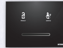
DOOR PANEL RFID BADGE Energy-saving with card presence control