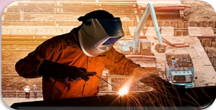
Protection against flame/spark