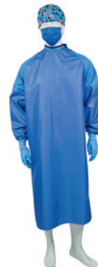
Laminates for reusable Surgical gowns and drapes washable & sterilisable EN 13795-1