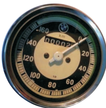
80mm BMW Speedometer R60 R69S R75-5, PART NO. ZHMS-1702