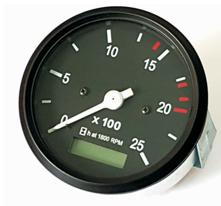
MF ELECTRONIC RPM ZHE-105R