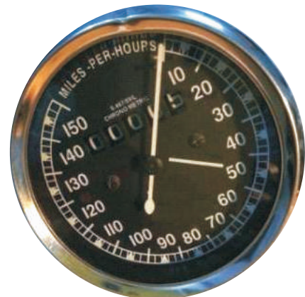
BMW Speedometer 80mm(0-150km/h) PART NO. ZHMS-1703