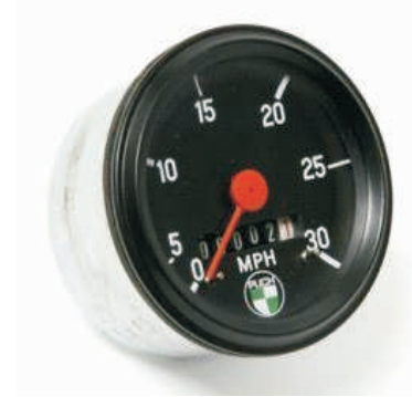
Black Puch Speedometer- Maxi Magnum Moped 48mm (0-30) PART NO. ZHMS-1716