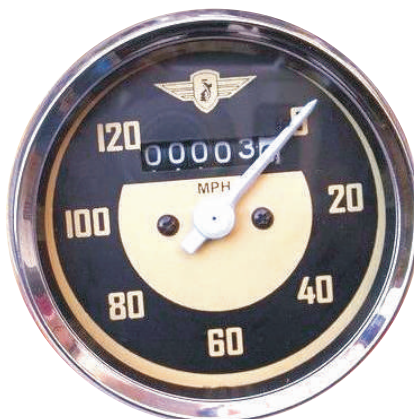
Zundapp Speedometer 80mm PART NO. ZHMS-1723