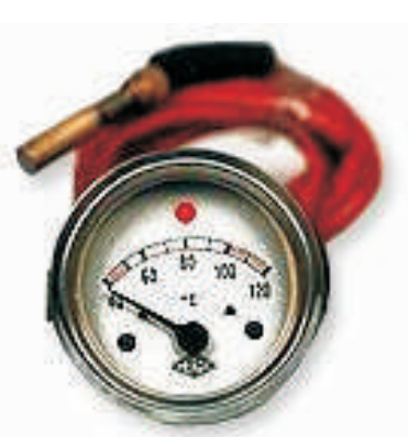
High temp gauge Universal,