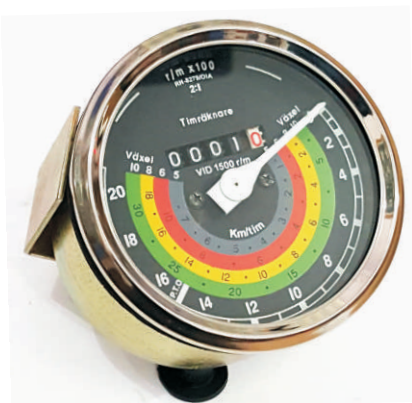
BM Volvo 350 PART NO. ZHT-1628