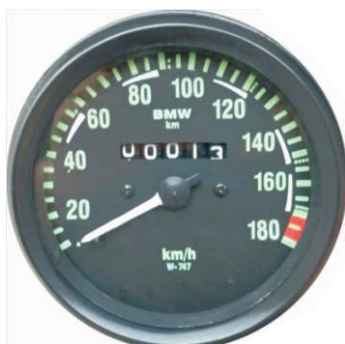
VINTAGE BMW MOTORCYCLE SPEEDO 180 KPH R100 R80 R81 R80GS ,RATIO W-747 DIA-100MM PART NO. ZHMS-1706