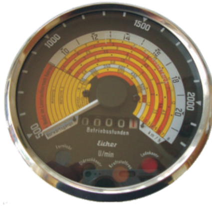
ZHT-1662 Eicher Ø 115 mm