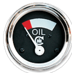
IHC Farmall Oil Pressure Gauges PART NO. ZHO-1202