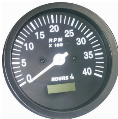
Part No.: ZHE-121