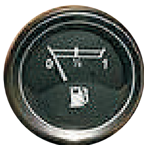
Fuel Gauge for Massey Ferguson Tractor PART NO. ZHF-1402