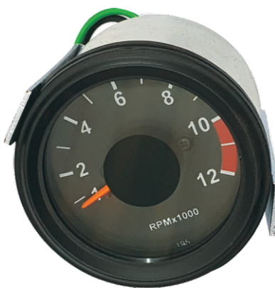
60mm(0-12) 12000 RPM, M50 Racing, jet ,X50-4 PART NO. ZHMS-1710,