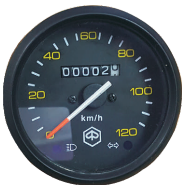
PART NO. ZHMS-1701