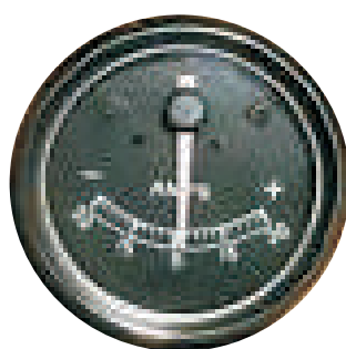
DAVID BROWN AMMETER PART NO. ZHA-1305