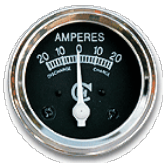
IHC Ampere Meter, PART NO. ZHA-1302