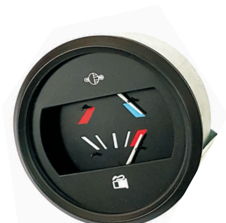
MF DUAL GAUGE ZHE-105G