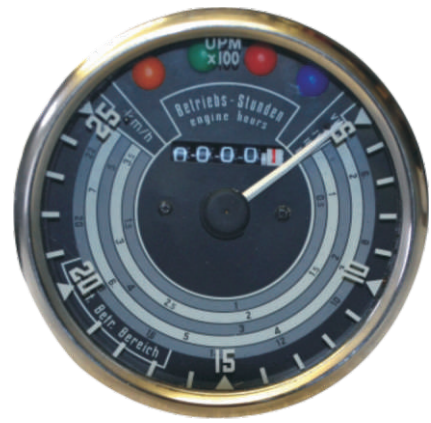
ZHT-1660 Porsche diesel, various- Ø 115 mm