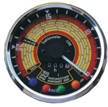
ZHT-1663 Deutz D2505, D3005, D2506, D3006 Ø 115 mm