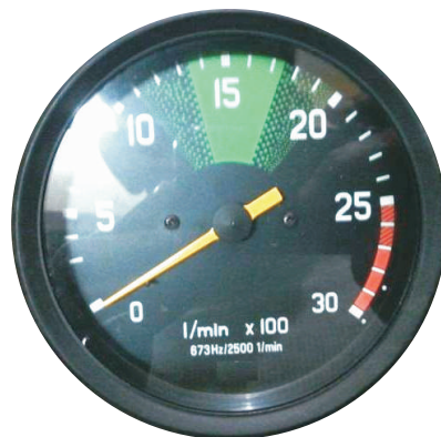
MERCEDES RPM METER ZHE-101