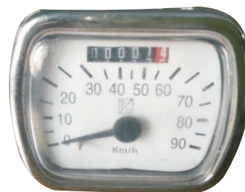
Vespa Piaggio speedometer PART NO. ZHMS-1732