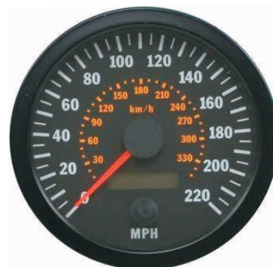
Vision Series Speedometer 0-220 MP 100MM Dia Electrical PART NO. ZHMS-1705