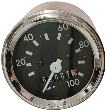
Puch-speedometer 60mm PART NO. ZHMS-1718