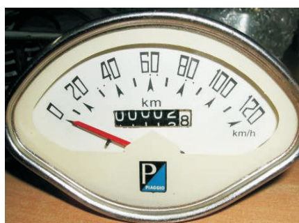
Vespa speedometer PART NO. ZHMS-1739