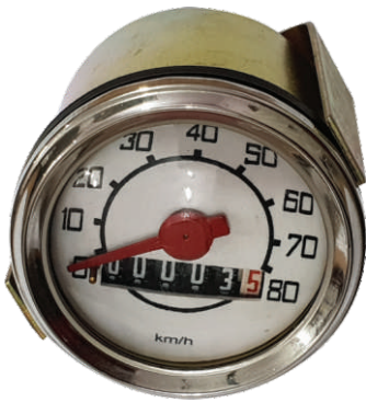
48MM Speedometer- Vespa 50- 80 km/h PART NO. ZHMS-1731