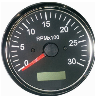
Part No.: ZHE-120