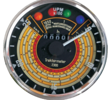
ZHT-1666 Deutz Ø 115 mm