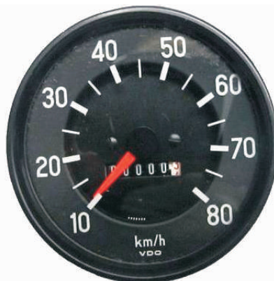
80mm(0-80) Speedometer- For Monza PART NO. ZHMS-1707