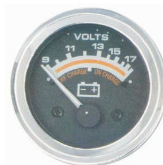
PART NO. ZHV-1504