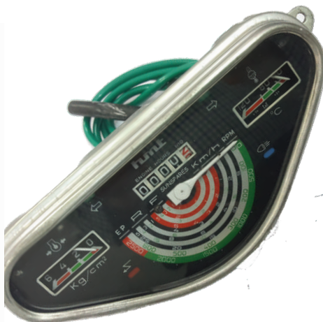
Instrument Cluster for Zetor Tractor 5711 5745 6711 6745 ZHT-1657