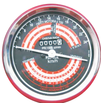
IMT HOUR METER, 577 part no. 577.09.220 PART NO. ZHT-1631