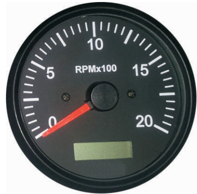
Part No.: ZHE-119RB