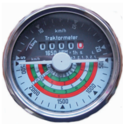
ZHT-1664 Deutz, D-series, D40 - D50 - Ø 80 mm