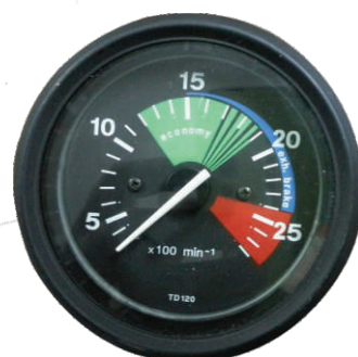
VOLVO RPM METER ZHE-102