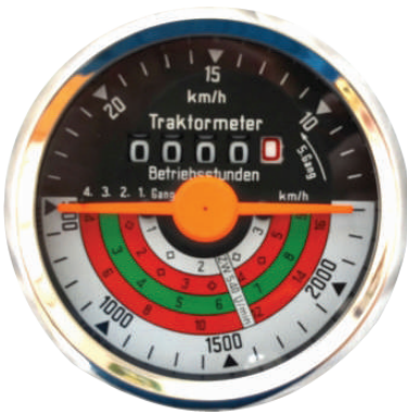
ZHT-1658 Deutz, D-series, D25.1 - Ø 80 mm