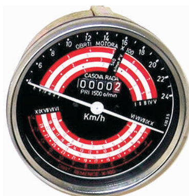
IMT MODEL-542-549 PART NO. ZHT-1632