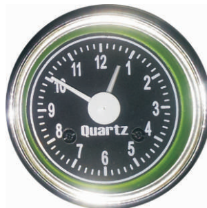
Part No.: ZHE-124