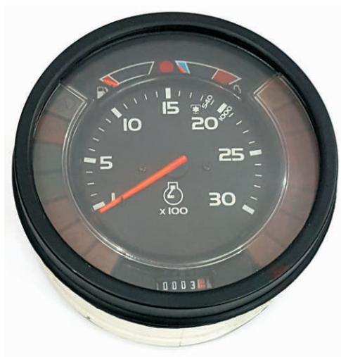
VALMET 705 TECHOMETER ZHE-103