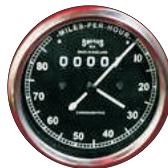
Replica Enfield Black0-80MPH PART NO. ZHMS-1734