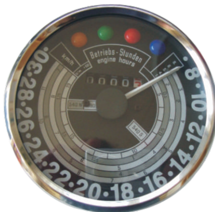
ZHT-1659 Güldner, Diverse Ø 115 mm