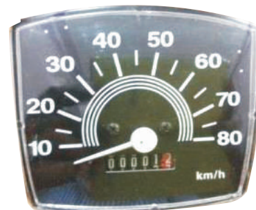
Speedometer-Vespa 50 Special PART NO. ZHMS-1729