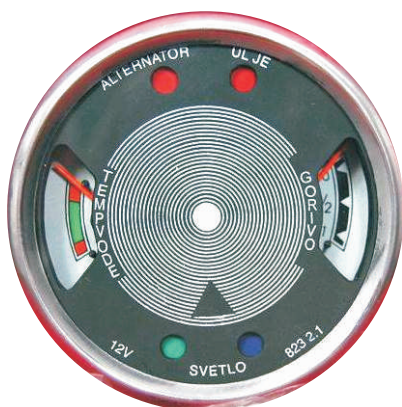
IMT CLUSTER 560/ 577 SMALL PART NO. ZHT-1635