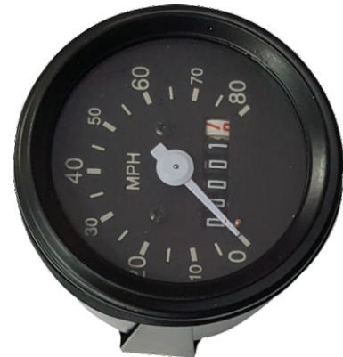
0-80km/h speedometer with white background-60MM Dia PART NO. ZHMS-1719