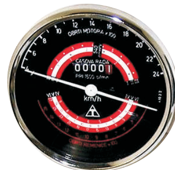
IMT MODEL-539 PART NO. ZHT-1630