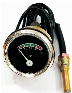
Temperature Gauge Valmet Tractor