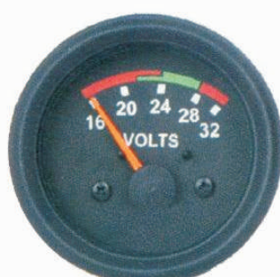
PART NO. ZHV-1507