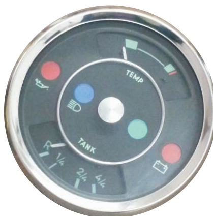
CLUSTER PART NO. ZHT-1636