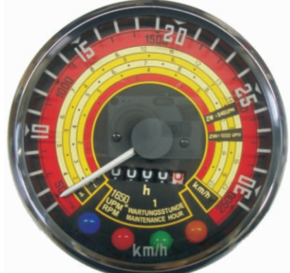
ZHT-1665 Deutz, Diverse Ø 115 mm