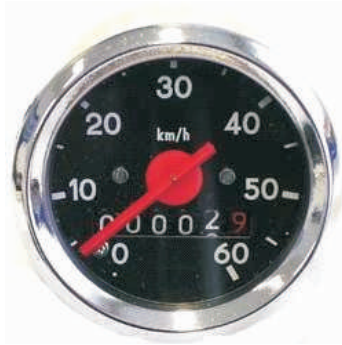
48mm (0-60) KTM Pony, Hobby For puch MS, Vs, MV, DS, Maxi ktm hobby, Pony 1 - PART NO. ZHMS-1715