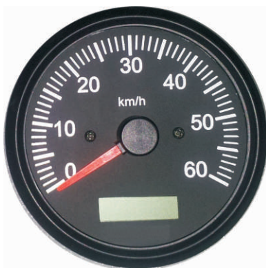
Part No.: ZHE-123