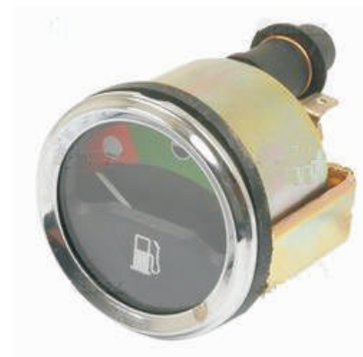
Universal Fuel Gauge PART NO. ZHF 1409