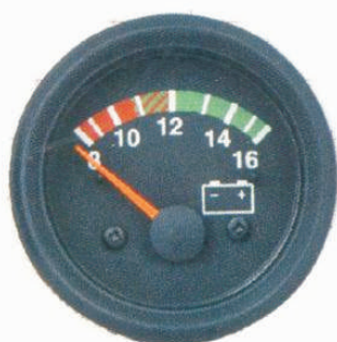
PART NO. ZHV-1508