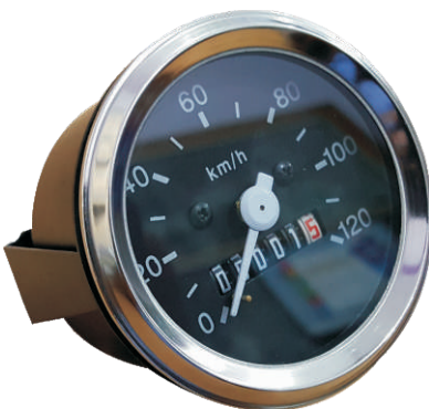
PART NO. ZH