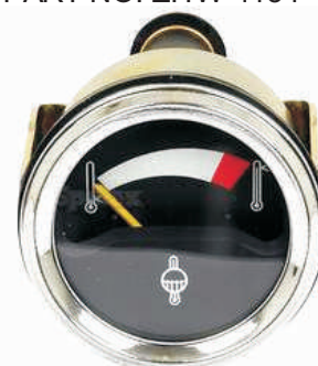
Temperature Case/IH Water