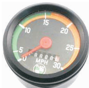
Puch-speedometer 48mm PART NO. ZHMS-1720