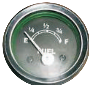
David Brown Tractor Fuel Gauge PART NO. ZHF-1404