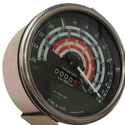
BM Volvo 400-430 PART NO. ZHT-1656