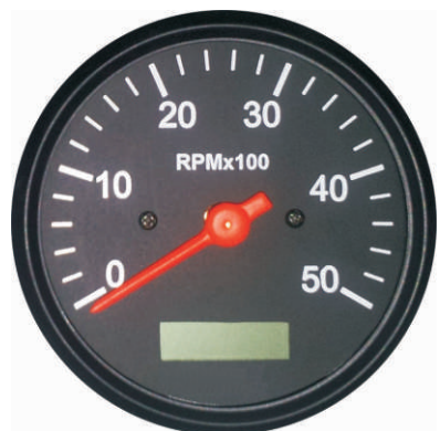
Part No.: ZHE-122