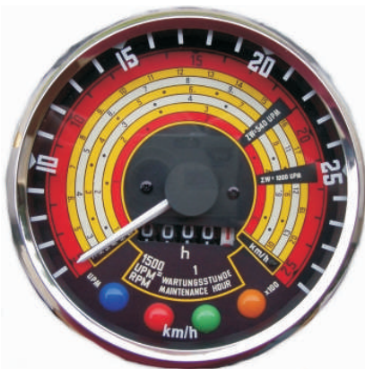
ZHT-1661 Deutz Ø 115 mm