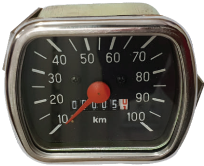
Tachometer( 0-100km) -MC50, R50 , KTM Ponny, Comet, PART NO. ZHMS-1711