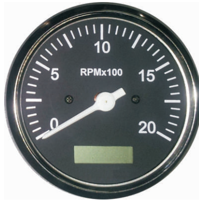
Part No.: ZHE-119W