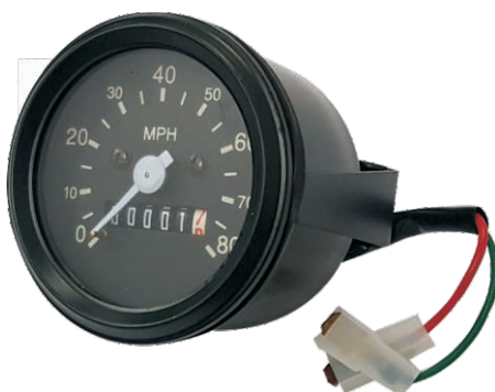
60mm (0-60,0-80,0-120km/h universal PART NO. ZHMS-1728