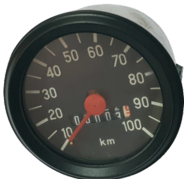
60 mm(0-100) For M50R,S,GP,SG,C,MCI PART NO. ZHMS-1709