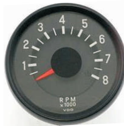
Puch monza tachometer - 8,000 rpm PART NO. ZHMS-1708