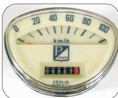
Vespa speedometer PART NO. ZHMS-1740