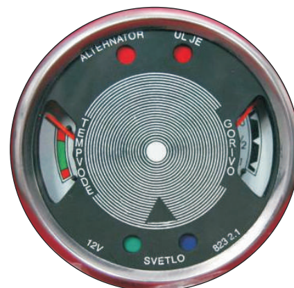
IMT CLUSTER 560/ 577 PART NO. ZHT-1633