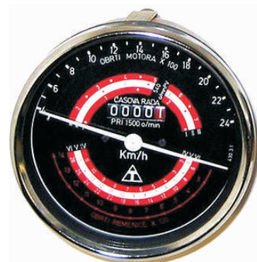
IMT MODEL 560 PART NO. ZHT 1634