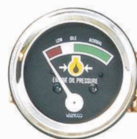
CATERPILLER OIL PRESSURE GAUGE PART NO. ZHO-1227