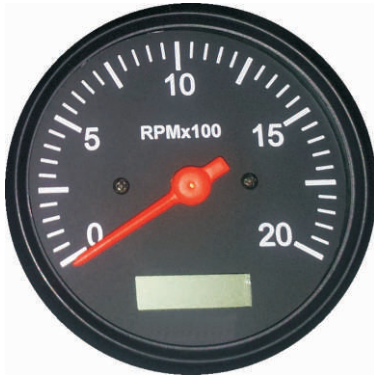
Part No.: ZHE-119R