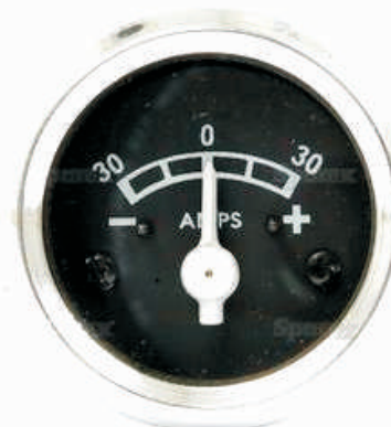
Massey Ferguson ammeter PART NO. ZHA-1309