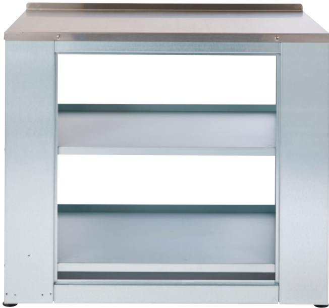
Without extraction module