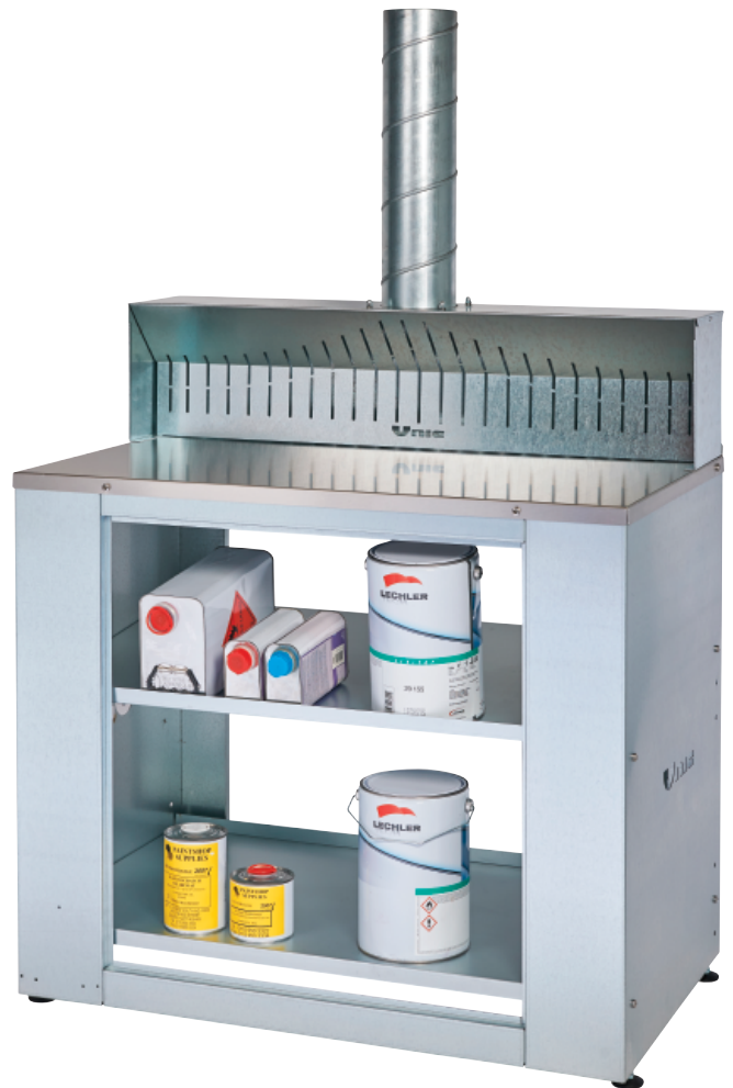
With extraction module