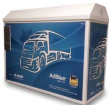
METRICS STATIONS AVAILABLE FROM 3000 - 5000 LITERS