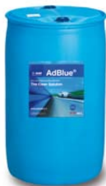
60 LITERS CAN