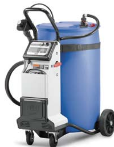
KIT DELPHIN PRO