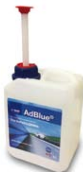
2 LITERS CAN WITH TELESCOPIC SPOUT