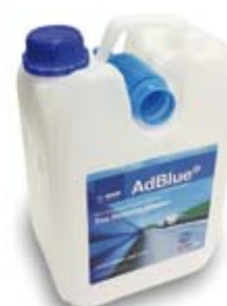
5 LITERS CAN WITH SPOUT