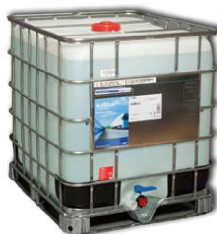
1000 LITERS IBC