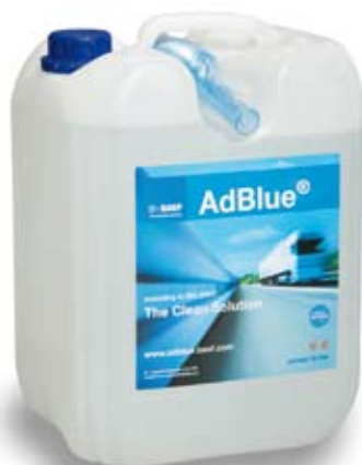
10 LITERS CAN