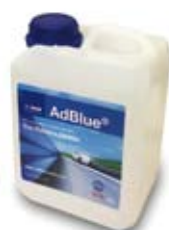
2 LITERS CAN WITH SPOUT