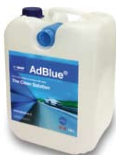
10 LITERS CAN