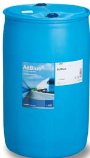
200 LITERS CAN