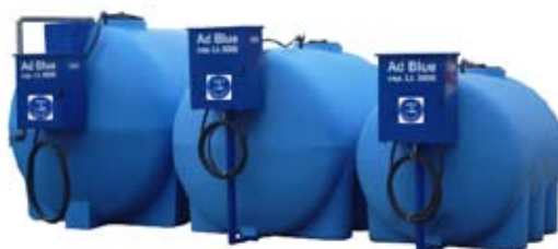
TANKS AVAILABLE FROM 3000 - 5000 - 8000 LITERS