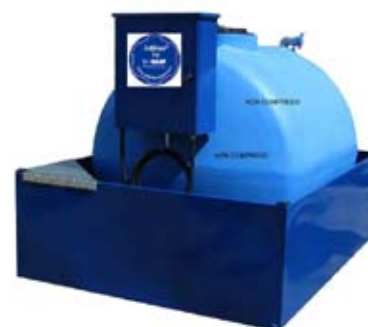
METAL CONTAINMENT BASIN FOR TANK