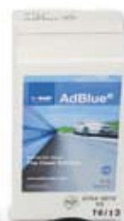
5 LITERS CAN WITH SET SPILL-FREE