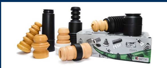
Dust covers, Bounce bumpers and Shock Absorber Service Kits ("SASK")