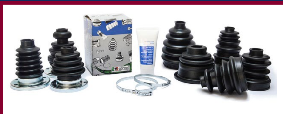
Cv-Boots as bulk and kits