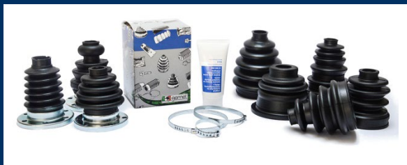
Cv-Boots as bulk and kits