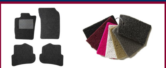
MAT+®, Car mats and mats for multiple purposes