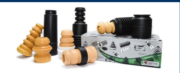
Dust covers, Bounce bumpers and Shock Absorber Service Kits ("SASK")