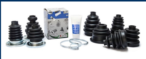
Cv-Boots as bulk and kits