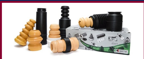
Dust covers, Bounce bumpers and Shock Absorber Service Kits ("SASK")