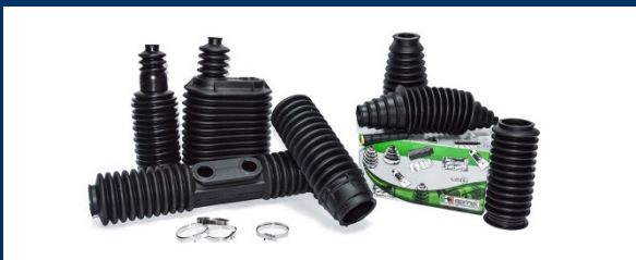
Steering gaiters as bulk and kits