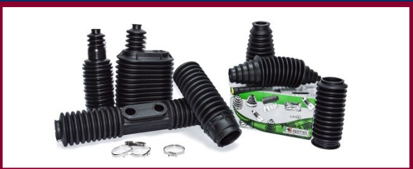
Steering gaiters as bulk and kits