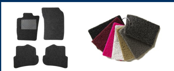
MAT+®, Car mats and mats for multiple purposes