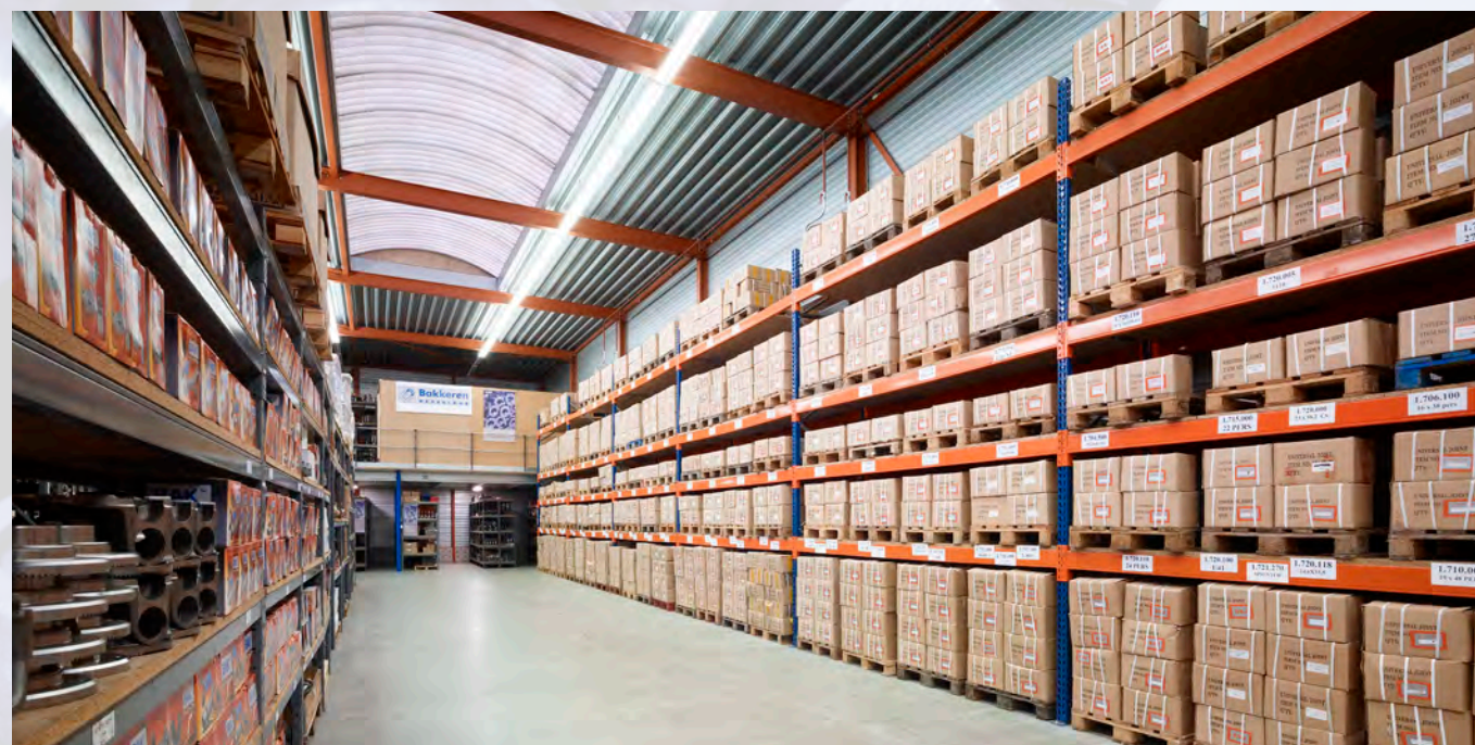
1000m 2 of universal joint driveline part

BKJ staked universal joints from Ø 15 mm uptil Ø 31 mm