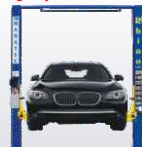
Rhino 4 HC (Clear Floor)