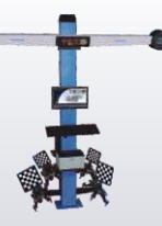
Fox 3D VHX