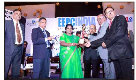
Winner of EEPC Award for 13 Consecutive years Since 2005