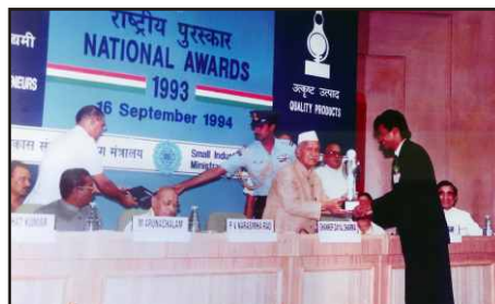
National Award for Best Entrepreneur and Quality Products in SSI Sector - 1993