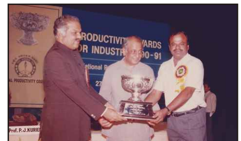
Best Productivity Performance Award - 1990-91