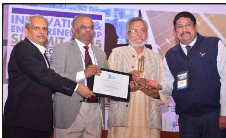
Confederation of Indian Industry Innovation Awards (CII) as one of the top 25 most innovative companies in India - for the year 2016