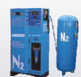
Nitrogen Filling Station