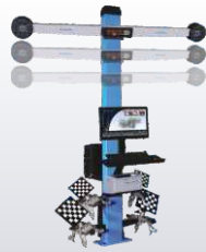
Fox 3D Auto BoomX