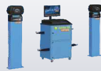
Jumbo 3D Optima