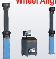
Jumbo 3D Super 3A, 4A, 5A & 6A