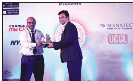
Tyre & Rubber industries Leadership Award - TRIA for the year 2015