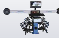
Fox 3D PTX