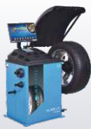
VL-65 LX / VL-65 LX Premium VL-65 LX Premium+