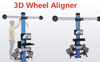
Fox 3D MBX