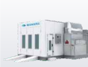
Paint Spray Booth