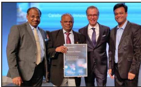
Innovation Award Automechanika, Germany - 2018