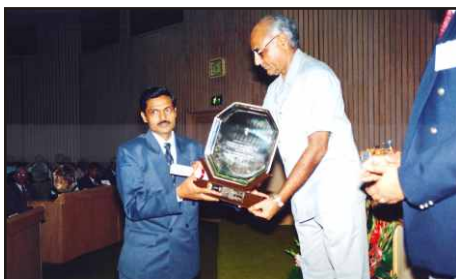
Award for Excellence in R&D (Electronics) - 1996