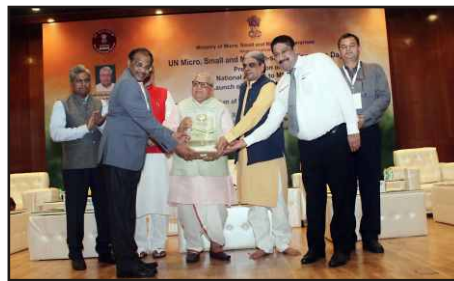
MSME Award for Quality Products - 2015