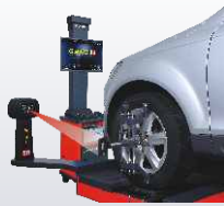
Genie 3D Elite