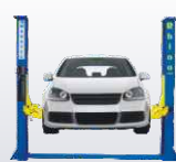
Rhino 3.5 HF / Rhino 4 HF (Floor Plate)