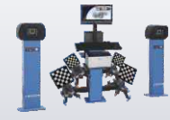
Fox 3D DTX