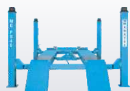
Four Post Lift