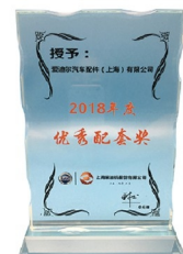
SAIC/SDEC Awards (2012-2018)