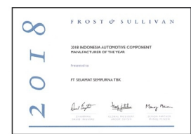
Frost & Sullivan Awards (2010, 2016, 2018)