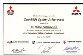
Mitsubishi Awards (2013-2015)