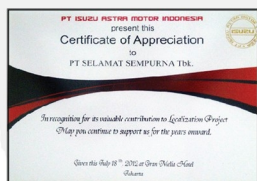
Isuzu Awards (2010, 2012)