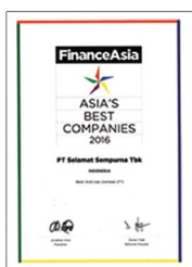
Finance Asia Awards (2014, 2016)