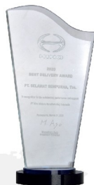
Hino Awards (2010, 2011, 2019 - 2021)