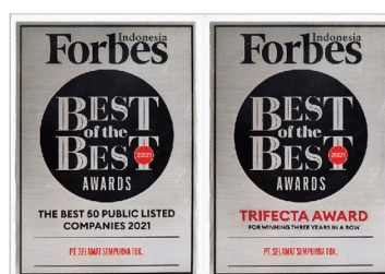
Best of the Best Awards (2021)