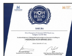
WOW Brand Awards (2015-2016)