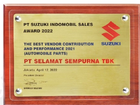
Suzuki Awards (2010, 2011, 2019 - 2022)

ADR Group Received Many Prestigious Awards & Appreciations Locally & Internationally