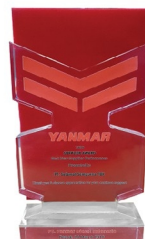
Yanmar Awards (2019)