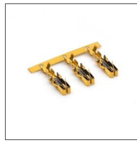
Heavy Duty Terminal (product code: T9071HD-T9072HD)