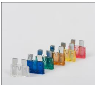
Blade Type Fuses (product code: S2XXX)