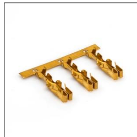
Terminal (product code: T9071-T9072)