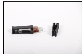
Fuse Puller (product code: FH6001)