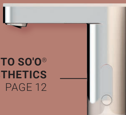
PRESTO SO'O® AESTHETICS PAGE 12