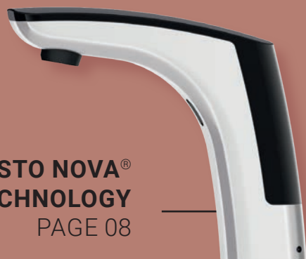
PRESTO NOVA® TECHNOLOGY PAGE 08