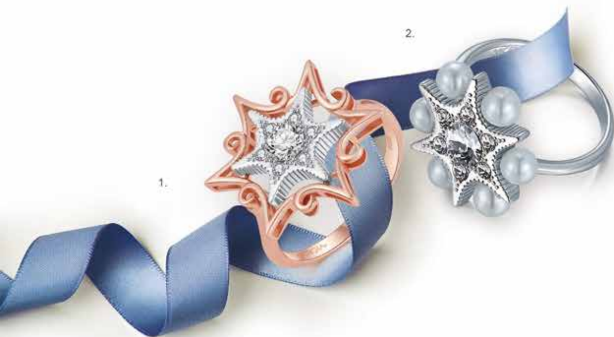
1. V5015R-005-SR 2. V5015R-006-S

VICACCI designer captures the essence of Elegance, Love and Hope. In addition to this, the new necklace highlights VICACCI' s craftsmanship and is adorned with glistening by Swarovski Crystal.