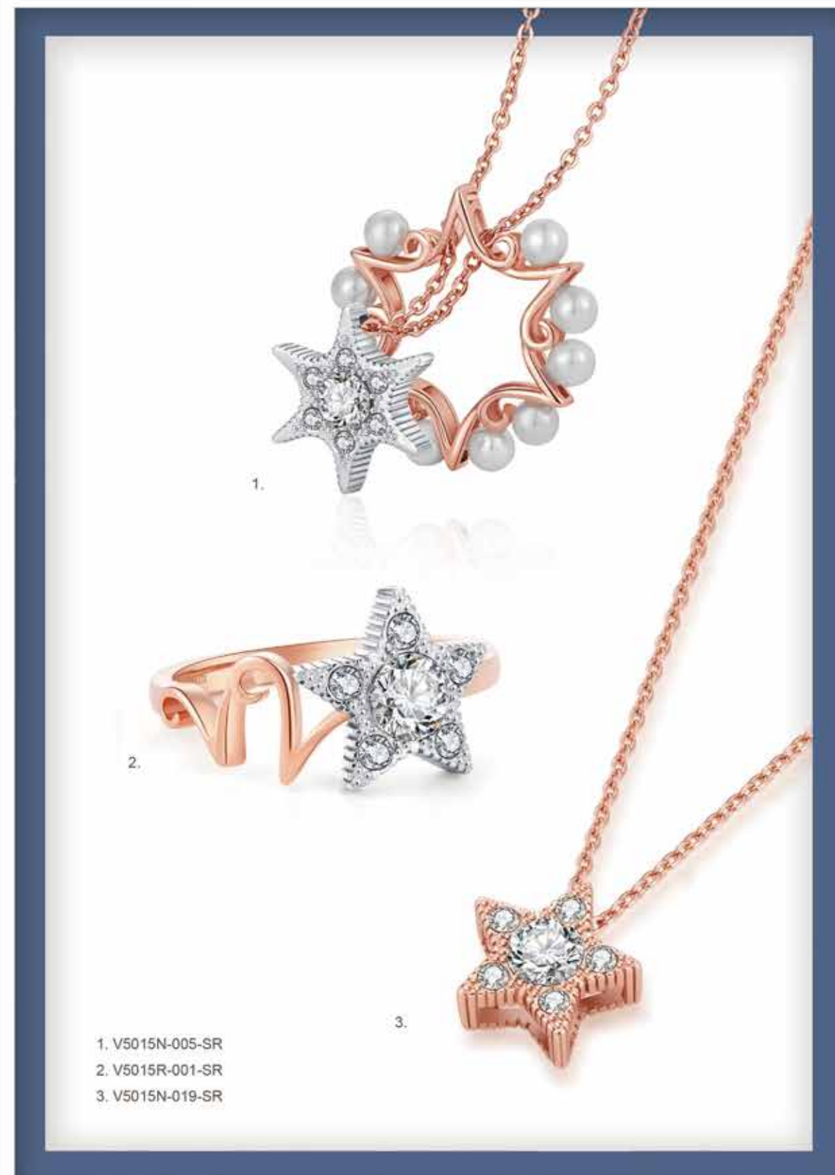
1. V5015N-005-SR 2. V5015R-001-SR 3. V5015N-019-SR