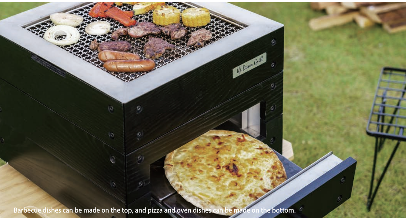
Barbecue dishes can be made on the top, and pizza and oven dishes can be made on the bottom.