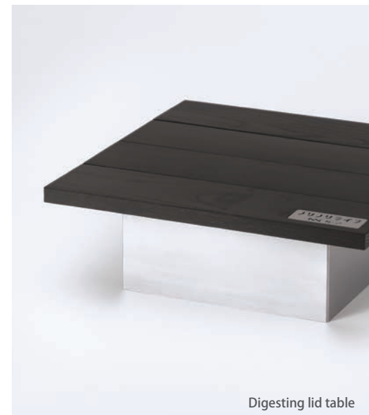
Digesting lid table