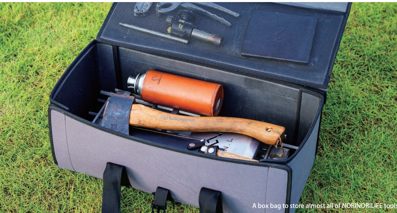
A box bag to store almost all of NORINORILIFE tools