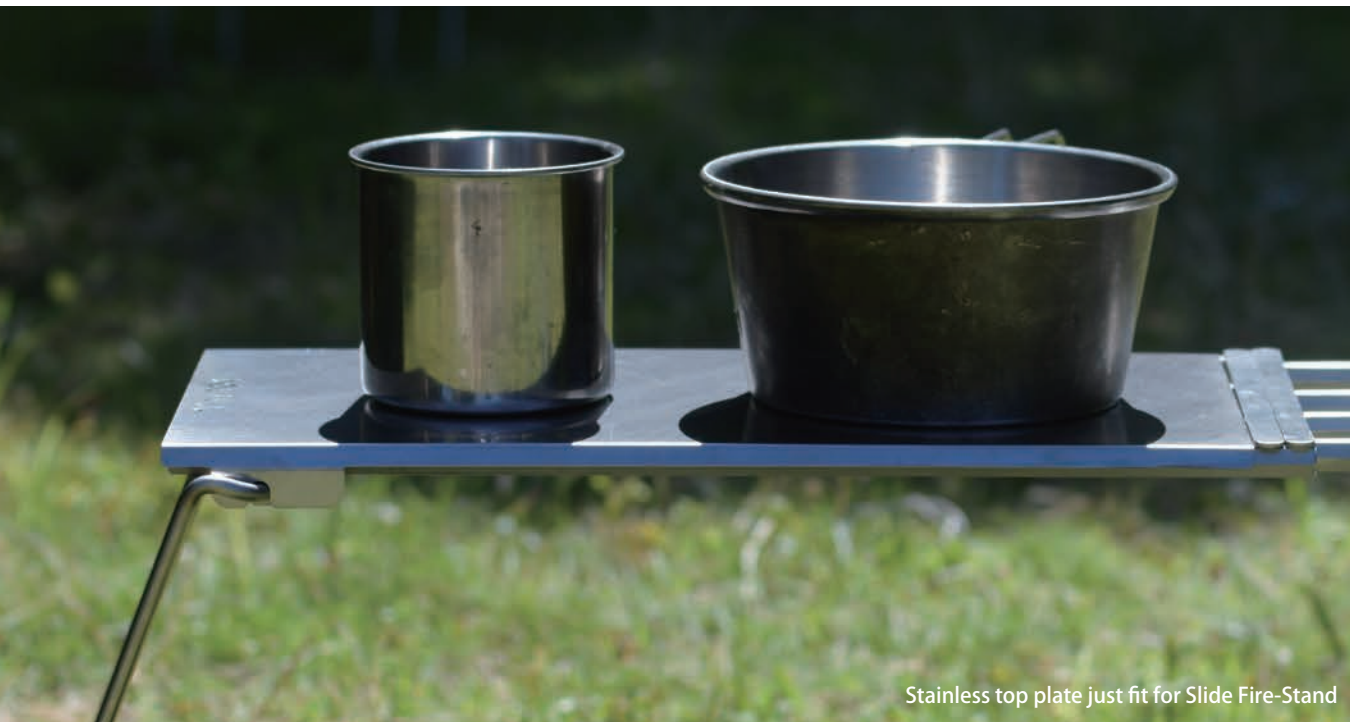
Stainless top plate just fit for Slide Fire-Stand