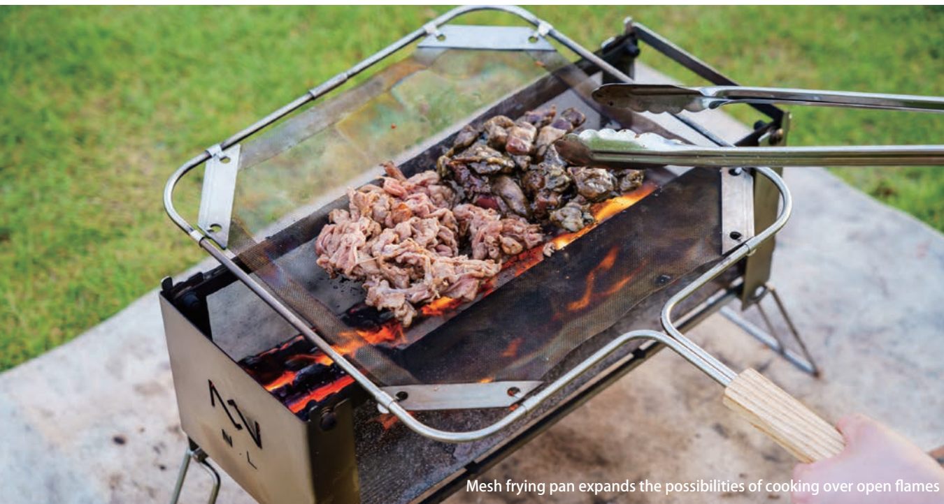
Mesh frying pan expands the possibilities of cooking over open flames