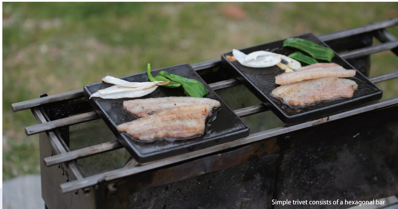
Simple trivet consists of a hexagonal bar