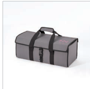
products of NORINORI LIFE in 2023