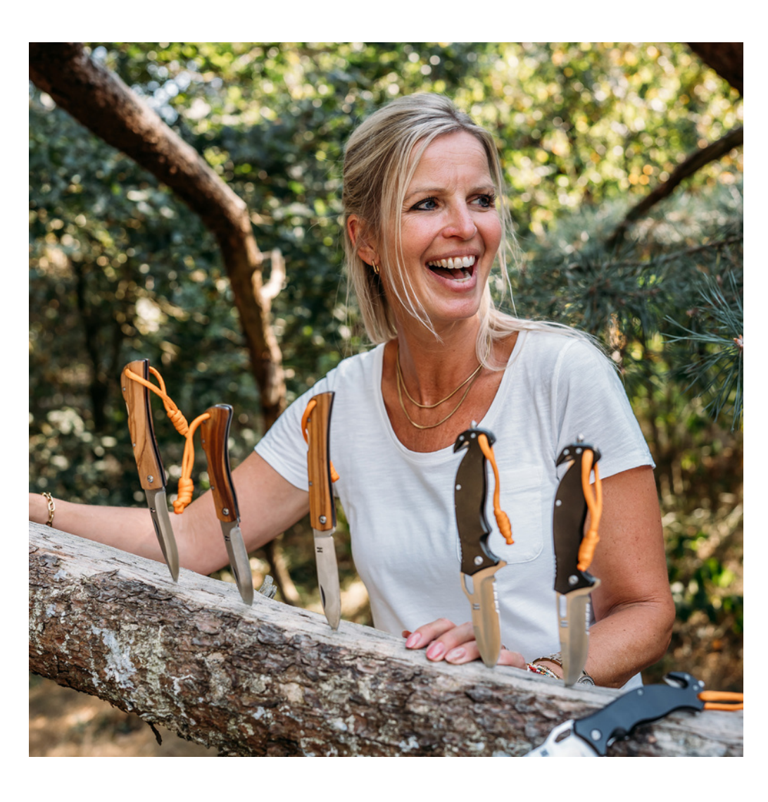
SUZAN Product Development