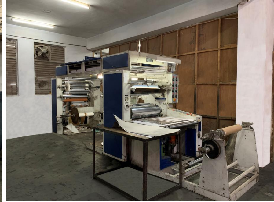
Multi-Purpose Lamination (wet, thermal and gumming)