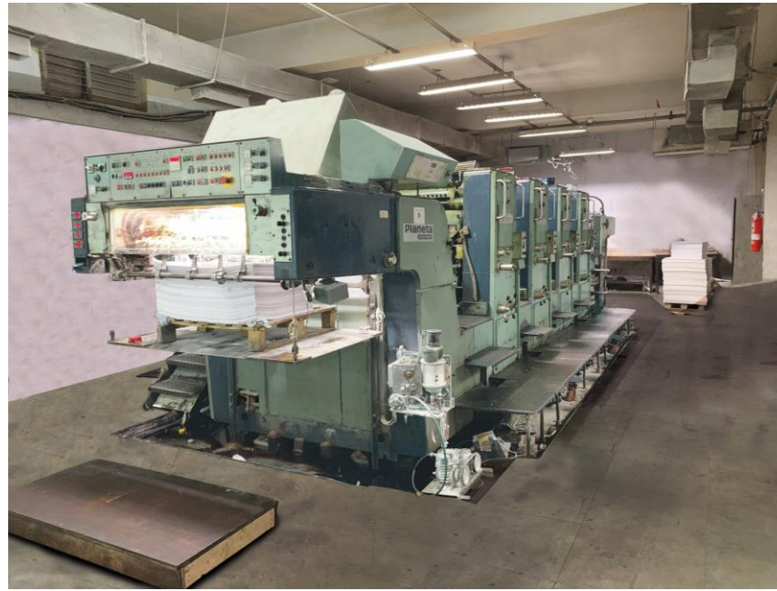
Super Variant Size: 710 x 1000 mm Colours: 4