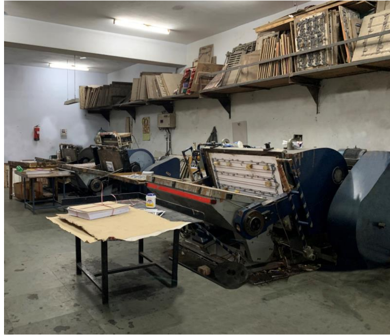
Die Cutting Machine with Foiling