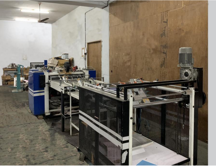
Automatic Graining Machine