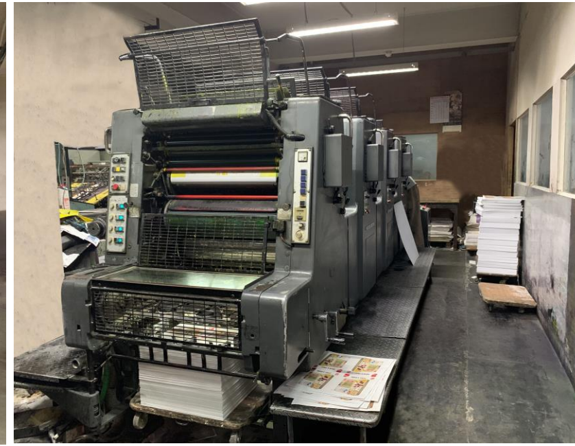
Heidelberg MOV with CPC Size: 480 x 650 mm Colours: 4