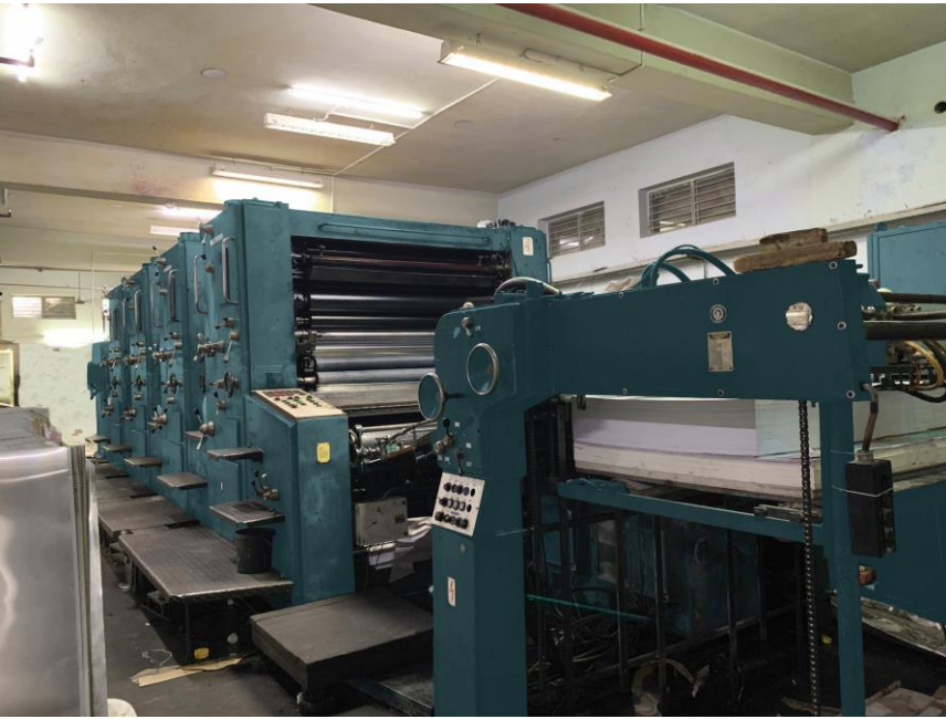
Variant Size: 1016 x 1400 mm Colours: 4