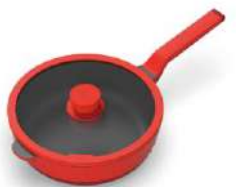
Rose Red Large