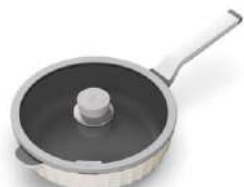
Light Cream Large