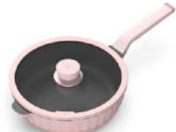
Sakura Pink Large