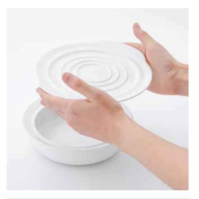
Plate cover and bowl lift is fitted with two-sided handle to reduce the use of muscle. It takes less force to hold and lift the bowl up with both hands.