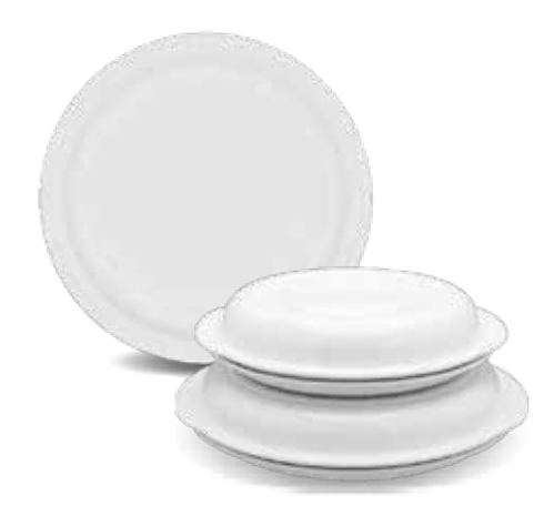
PLATE + COVER

Designed to use as a main dish. Come in 2 different size with its cover. While the covers can be used as a bowl.