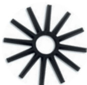
Black 18cm diameter 4806012