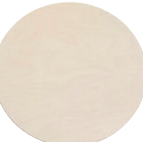
Round Birch Place Mat, Natural, 29.5cm Diameter 2290467