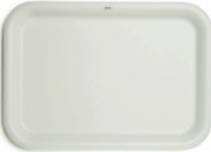
Large, White, 52 x 37cm 2261080