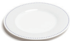
Plate, cobalt, 27cm 3413030