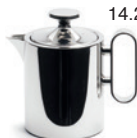
Teapot, Stainless Steel Handle, 0.5lt, 14.2cm 4802012