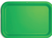
Large, Bright Green, 52 x 37cm 2261010