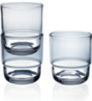
Clear, 28cl. 9cm 1726009