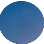
Round Birch Place Mat, Blue, 29.5cm Diameter 2290446