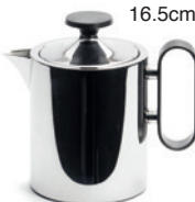
Teapot, Grey Metallic Handle, 1lt, 16.5cm 4802048