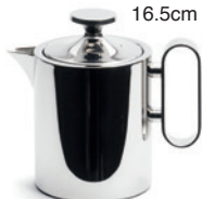
Teapot, Stainless Steel Handle, 1lt, 16.5cm 4802030