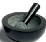
Large, 1lt. 9.5 x 22cm 1231010