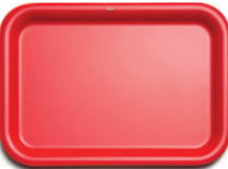
Large, Red, 52 x 37cm 2261090