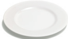
Plate, 27cm 3413026