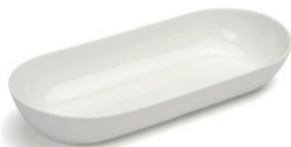
Oval Serving Bowl, 31cm 3412072