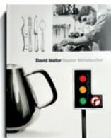
David Mellor Master Metalworker 27 x 21cm 1000115

Definitive book on the life and work of one of Britain's great designers. Mellor's range as a designer extends from magnificent craft silver to the traffic lights we stop at everyday. 192 pages, fully illustrated with superb colour pictures.