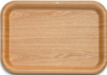
Large, Willow, 52 x 37cm 2261120