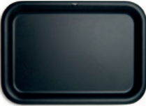
Large, Charcoal Grey, 52 x 37cm 2261050