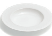
Rimmed soup plate, 24cm 3413044