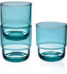
Sea green, 28cl. 9cm 1726018