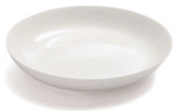
Low Serving Bowl, 30cm 3412065