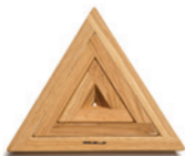
Triple Trivets, Oak, 24 x 21cm 2290043

Our own-brand woodware is handmade by small specialist craft workshops from sustainably-sourced wood. All made to our own unique designs, these are really top-quality products. The natural finish and smooth surface of the specially selected hardwoods make them ideal for kitchen use. Our spectacular handmade knife blocks are designed to take all collections of David Mellor knives.