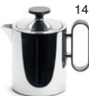
Teapot, Grey Metallic Handle, 0.5lt, 14.2cm 4802024