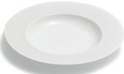
Rimmed pasta plate, 30cm 3413050