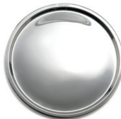
Round Tray, 35cm 4802310