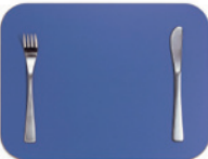
Rectangular Birch Place Mat, Blue, 39.5 x 29.5cm 2290472