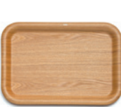
Small, Willow, 36 x 28cm 2261185