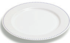
Serving plate/under plate, 30.5cm, cobalt 3413038