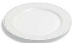
Serving plate/under plate, 30.5cm, aquamarine 3413032