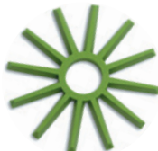
Green 18cm diameter 4806038