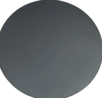
Round Birch Place Mat, Grey/Black, 29.5cm Diameter 2290452