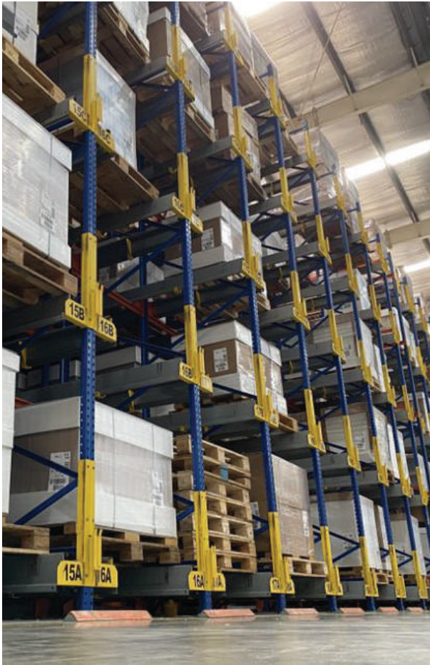
Handling of components is 100% palletized