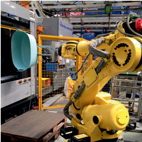
Part removal by 6-axis robot