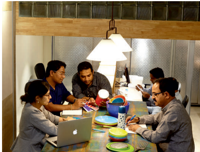
Full-fledged product design team with an in-house tool design setup