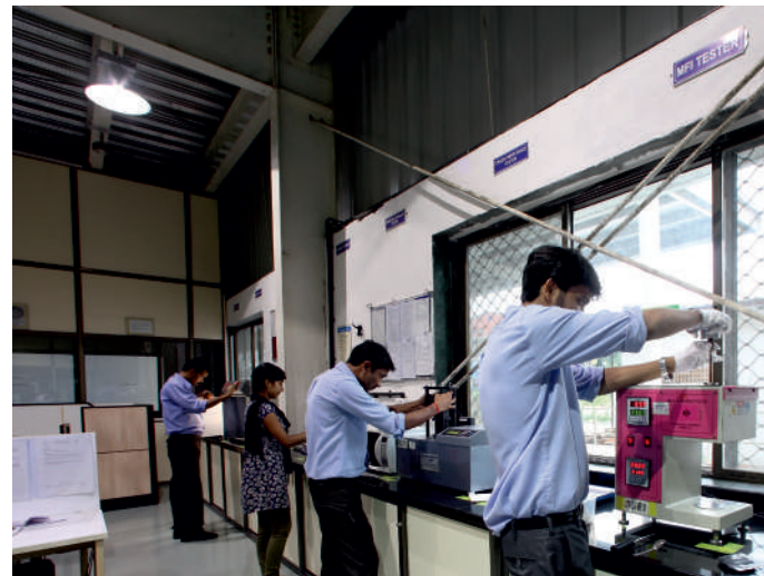
Test laboratories for raw material and product testing equipment to ensure product safety