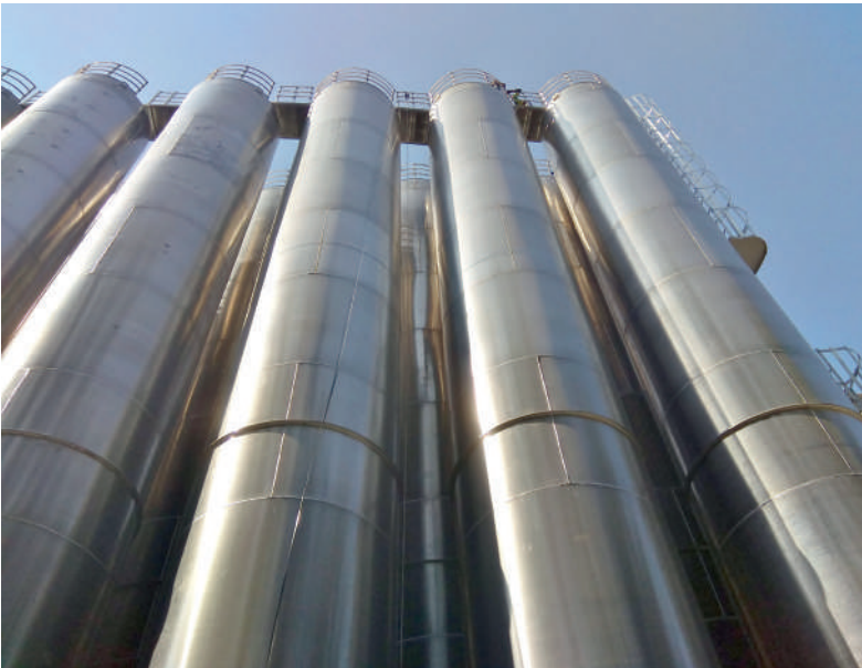
Raw material conveyed through silo system