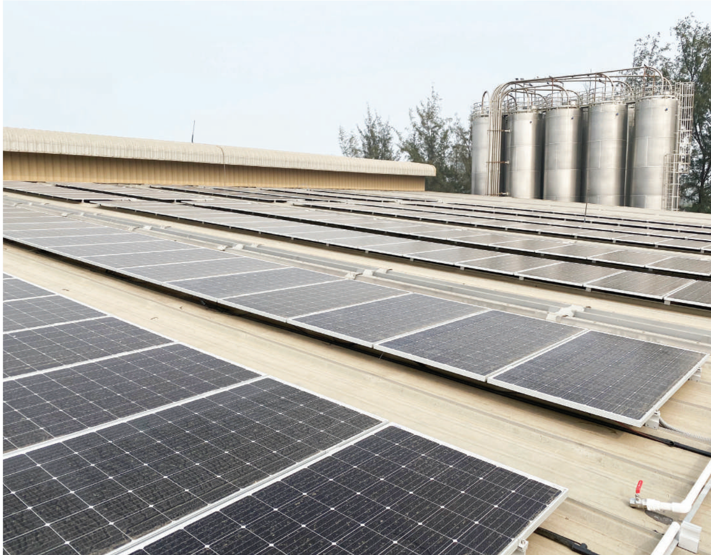
Solar installation at the Silvassa facility