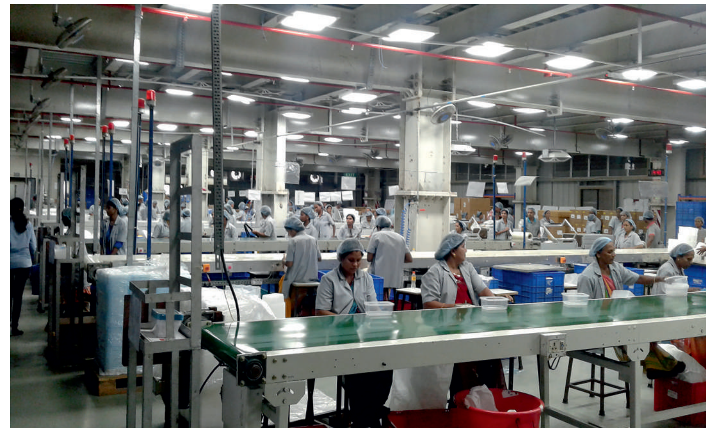
Optimized layout of Packaging lines