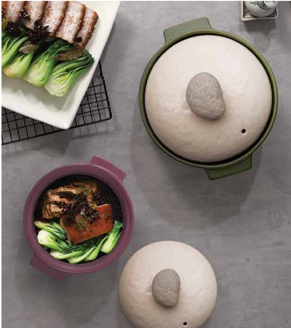
Kiesel Nature knows best