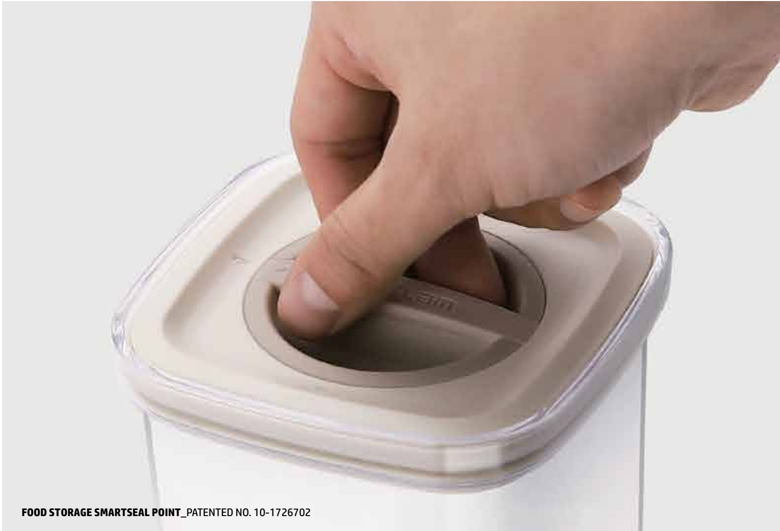
FOOD STORAGE SMARTSEAL POINT_PATENTED NO. 10-1726702