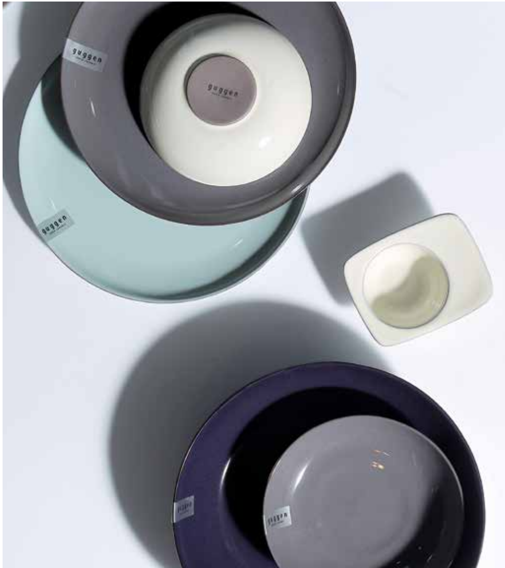
guggen Designer's choice