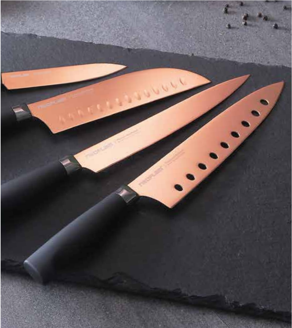
Titanium reinforced coating knives Experience remarkable cut