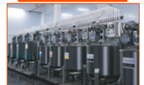
Ink Purification Workshop