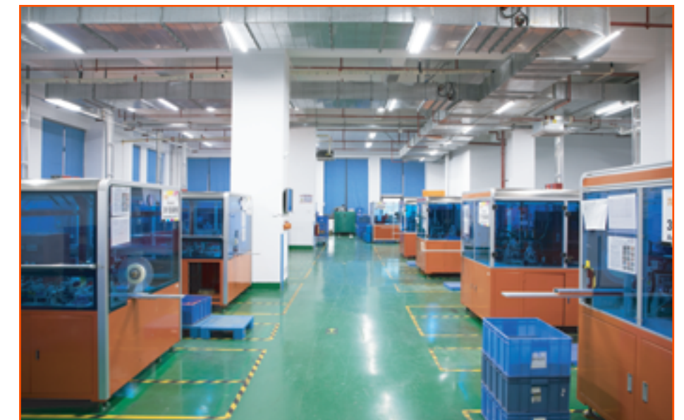
Cartridge Production Workshop