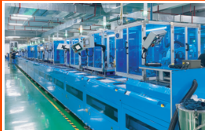
Toner Cartridge Automated Production Line