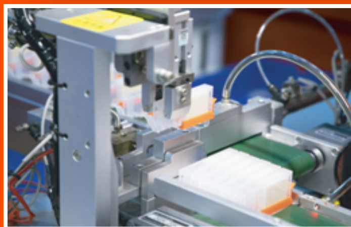
Cartridge Automated Production Line