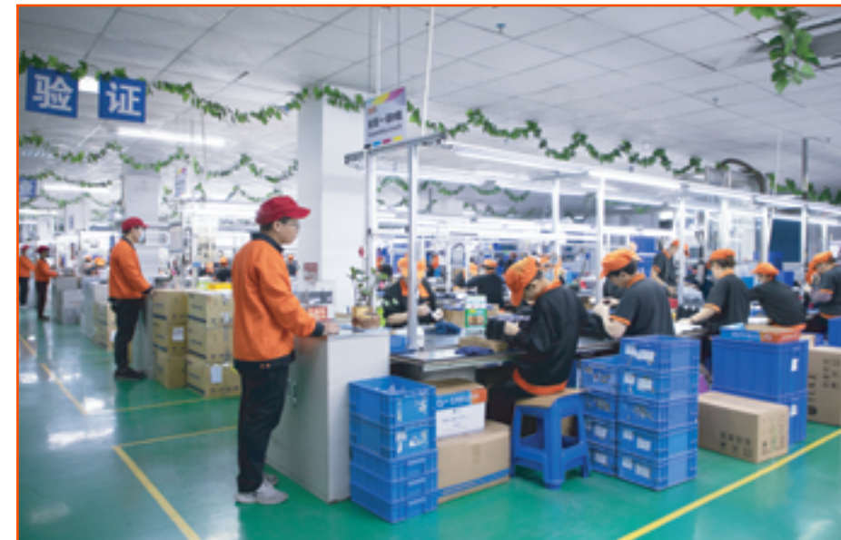
Toner Cartridge Production Workshop