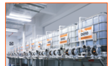
Ink Production Workshop