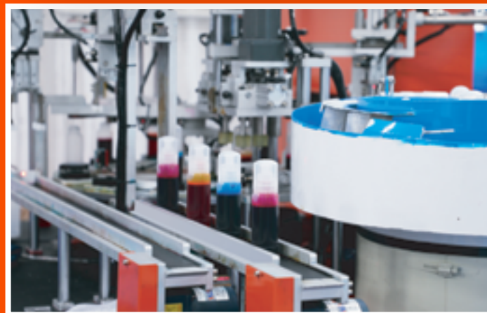
Ink Automated Production Line