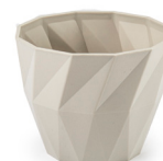
20027 Quartz ø 19 cm