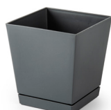
20034 Volcano 14 cm