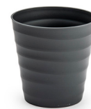
20012 Desert ø 21 cm