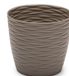
20019 Wind Ø 27 cm