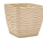
20039 Wind 19 cm