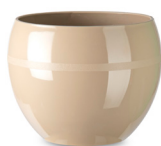
20022 Coco Ø 17 cm