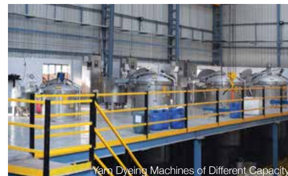
Yarn Dyeing Machines of Different Capacity