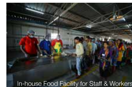
In-house Food Facility for Staff & Workers