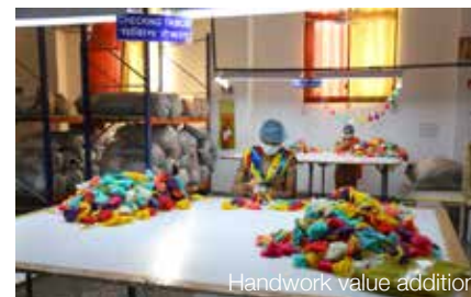
Handwork value addition