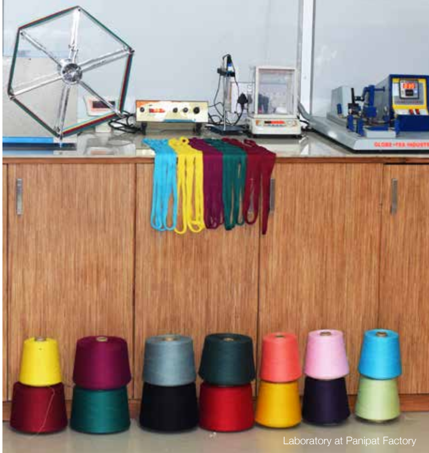
Laboratory at Panipat Factory