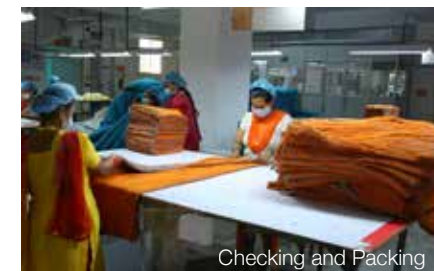
Checking and Packing