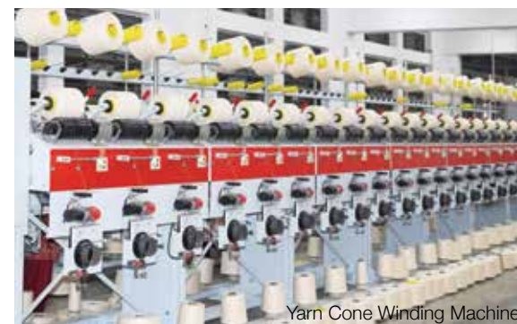
Yarn Cone Winding Machine