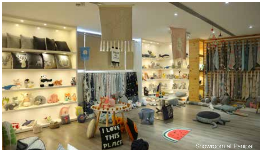
Showroom at Panipat

The knitting facility is equipped with fully computerized knitting machines from Germany. Alongside are state-of-the-art cutting unit, stitching unit with laser machines, embroidery machines, edge treatment machines and washing facility.