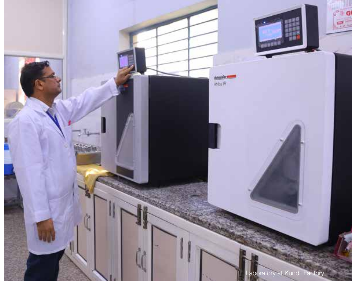
Laboratory at Kundli Factory