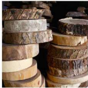
Acacia wood slice