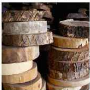
Acacia wood slice