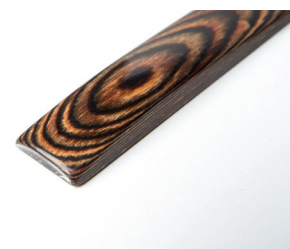
189 COMPRESSED ALPINE