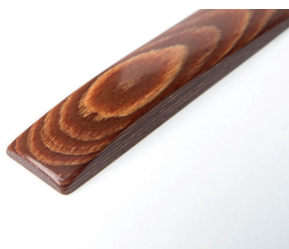
130 COMPRESSED NATURAL