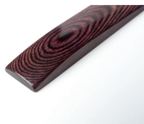
143 COMPRESSED ROSEWOOD