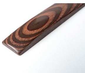
135 COMPRESSED GUINEA