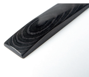
141 BLACK COMPRESSED