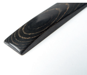
133 BLACK COMPRESSED