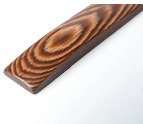
132 BROWN COMPRESSED