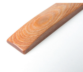
146 NATURAL COMPRESSED