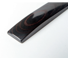
150 BLACK COMPRESSED