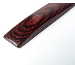
136 COMPRESSED CORAL