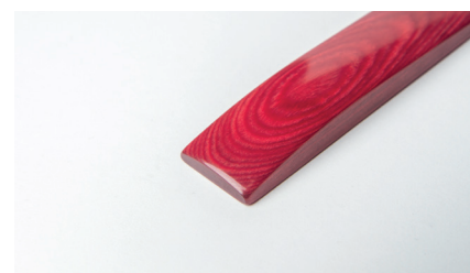
145 RED COMPRESSED.