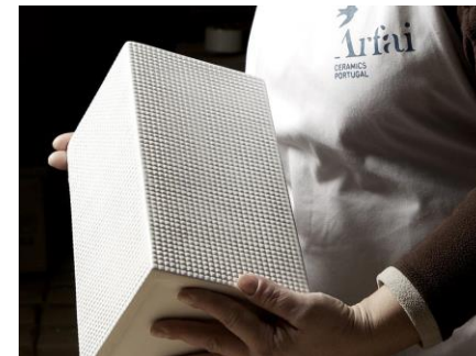
Quality Control & Packing