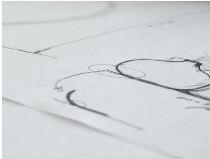
Drawing the idea

Ceramics made in Portugal, with hands and with love (and know-how)