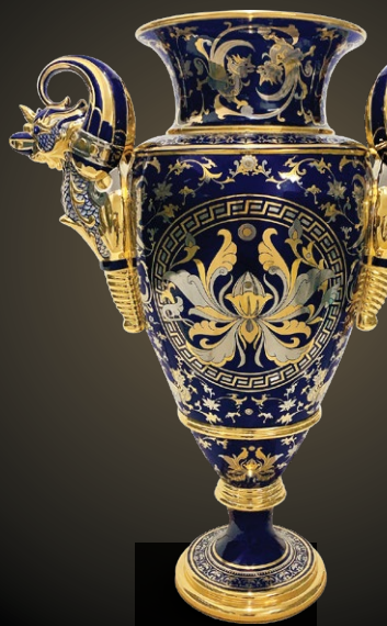
The Wandering Dragon Minh Long I Cup, gifted to celebrate the 13th National Congress of the Communist Party of Vietnam

The 100L Healthycook porcelain pot was recorded as "Vietnam's largest capacity". by Vietnam Record Organization - Vietkings