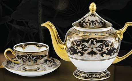
The Queen Lotus tea set, gifted to the leaders of ASEAN countries in 2020.