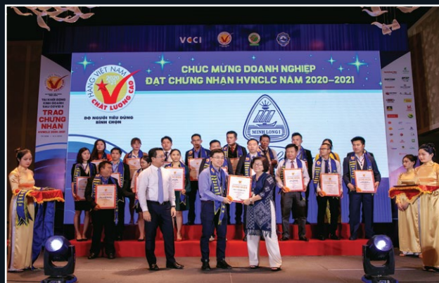
High Quality Vietnamese Products for 26 times.