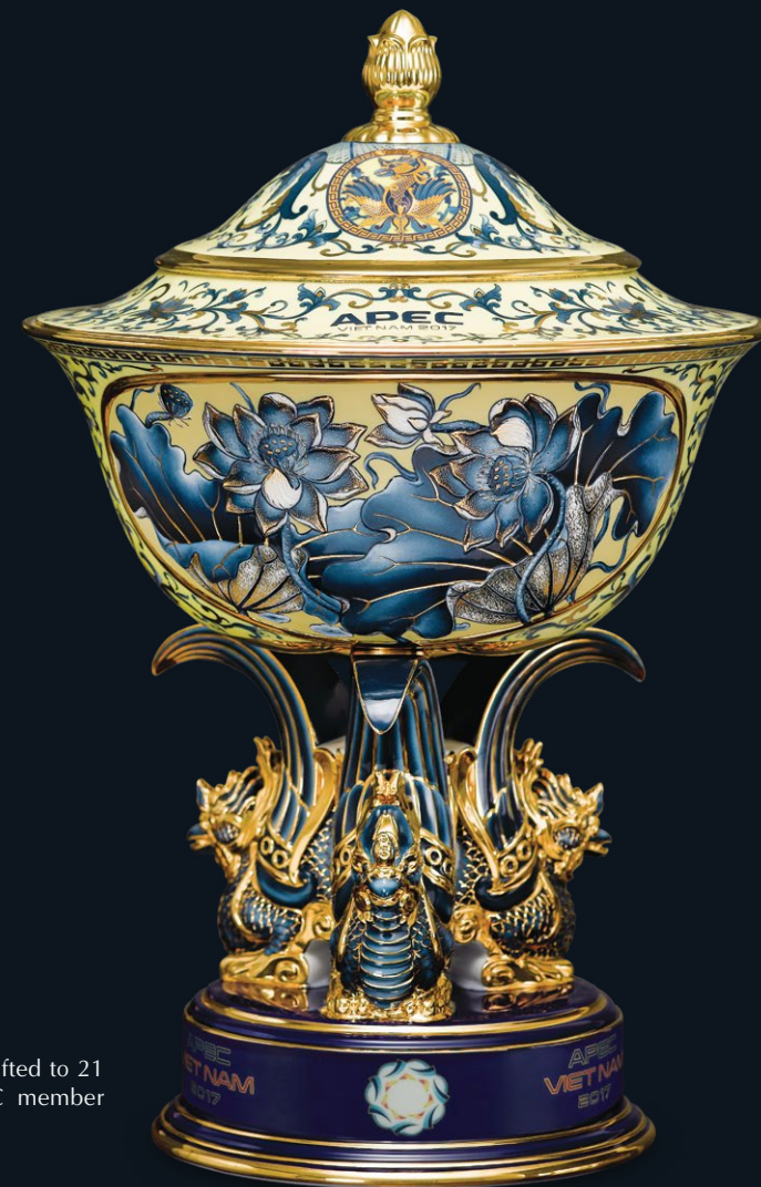
The APEC Jade Bowl, gifted to 21 world leaders as APEC member economies in 2017.