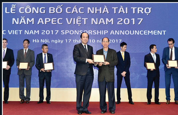
Minh Long I - the title sponsor of APEC VIETNAM 2017.