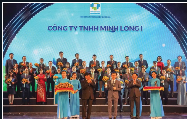
Vietnam Value Award for 7 times.