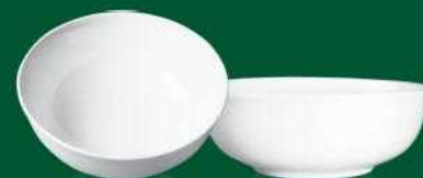
E - 801 NOODLE BOWL 20 cm / 7.75"