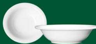
E - 625 GRAPE FRUIT BOWL 16 cm / 6.5"