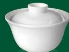
E - 322 CIA PEI TEA CUP WITH LID 6.6 oz 198 ml