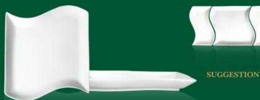
E-309 WAVE DISH 27 cm x 27 cm / 10.5" x 10.5"