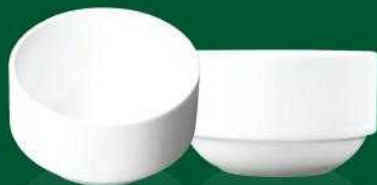
E - 056 BOUILLON BOWL 9.5 oz / 280 ml