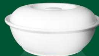
E - 319 STACKABLE CASSEROLE WITH LID 63 oz 1865 ml