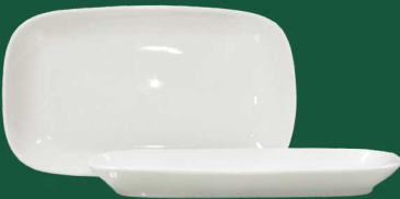
RECT. COUP PLATE F57