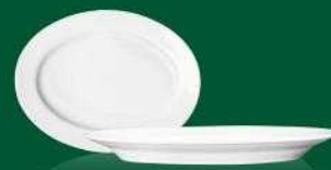
E - 555 RIM OVAL DISH 24 cm / 9.5"