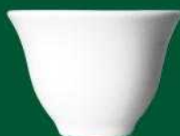
E - 321 TIO CIU TEA CUP / SAKE CUP 1.5 oz 40 ml