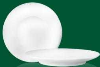
C - 004 COUPE SIDE PLATE 16.5 cm / 6.5"