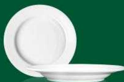
E - 020 RIM SALAD PLATE 20 cm / 8.15"