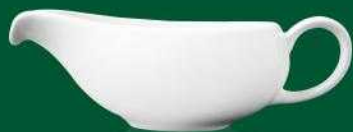
E - 041 SAUCE BOAT 7 oz 220 ml