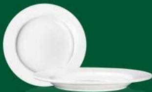
E - 014 RIM DINNER PLATE 27 cm / 10.5"