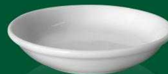
E- 300 SAUCE DISH 10 cm / 4"