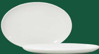
OVAL PLATTER F14