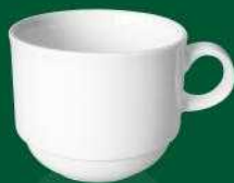
E - 031 TALL STACKING CUP 8 oz 260 ml