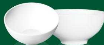
E - 803 RICE BOWL 11 cm / 4.5"