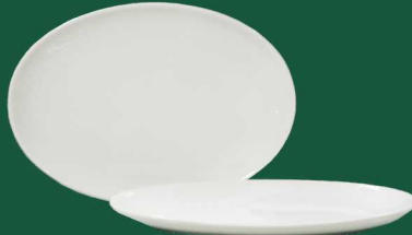
OVAL PLATTER F24