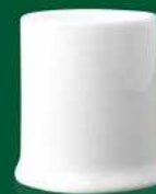
E - 306 TOOTH PICK HOLDER 5.5 cm / 2.15"