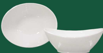
OVAL BOWL F43