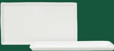
RECT. FLAT TRAY F45