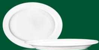
E - 063 RIM OVAL DISH 37 cm / 14.5"