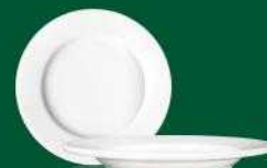
E - 010 BB RIM PLATE 16 cm / 6.5"