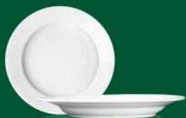
E - 520 RIM ENTREE PLATE 23 cm / 9"