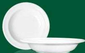
E - 713 RIM PASTA BOWL 28 cm / 11.25"