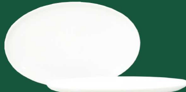
OVAL PLATTER F29