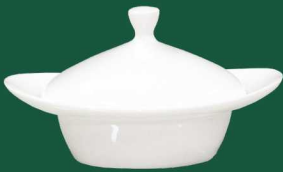
COVERED OVAL BOWL F50