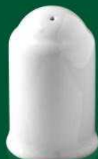
E - 302 PEPPER SHAKER 8 cm / 3.2"