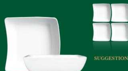
E - 311 WAVE BOWL 17.8 cm x 17.8 cm / 7" x 7"