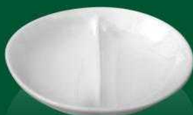
E - 317 DIVIDED SAUCE DISH 10 cm / 4"