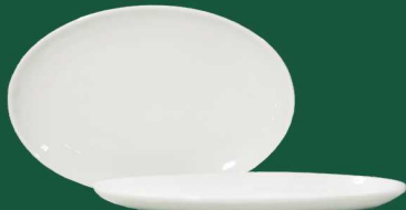
OVAL PLATTER F20