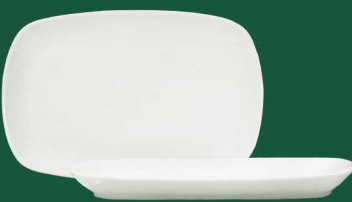
RECT. COUP PLATE F59