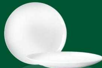
C - 003 COUPE SALAD PLATE 21 cm / 8.25"