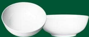
E - 802 NOODLE BOWL 17 cm / 7"