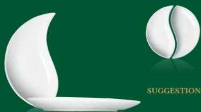
E - 308 YIN - YANG DISH 27 cm / 10.5"