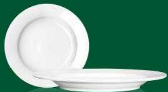
E - 122 RIM CHOP PLATE 30 cm / 12"