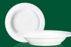
E - 018 RIM FRUIT BOWL 13 cm / 5"