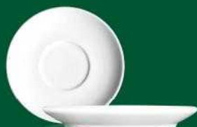
E - 734 CAPPUCINO SAUCER 17 cm / 6.75"