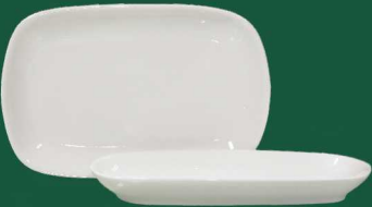
RECT. COUP PLATE F56