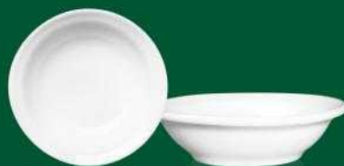
E - 307 SOY SAUCE DISH 9 cm / 3.5"