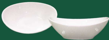
OVAL BOWL F41