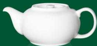
E - 047 CHINESE TEA POT WITH LID 32 oz / 940 ml