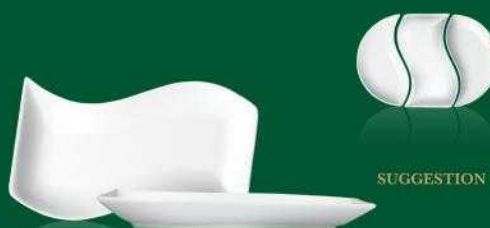
E-310 WAVE DISH 23 cm x 13 cm / 10.5" x 6.1"