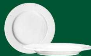
E - 013 RIM DINNER PLATE 26 cm / 10.25"