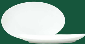
OVAL COUPE PLATTER F47