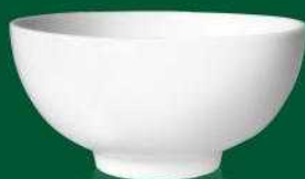
E - 805 SOUP BOWL 10,5 cm / 4.25"