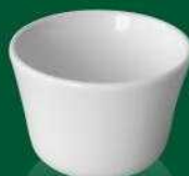
E - 320 CHINESE TEA CUP 5.2 oz / 155 ml