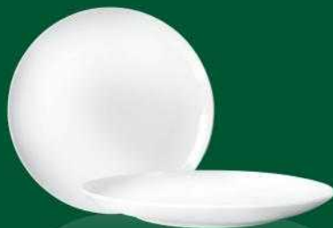
C - 002 COUPE DINNER PLATE 27.5 cm / 10.75"