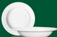
E - 015 RIM SOUP PLATE 23 cm / 9.25"