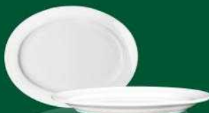
E - 519 RIM OVAL DISH 32 cm / 12.75"