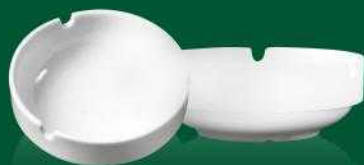
E - 305 ROUND ASHTRAY 10.5 cm / 4.25"