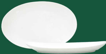
OVAL COUPE PLATTER F49