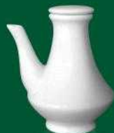
E- 042 VINEGAR POT WITH LID 4.6 oz 136 ml