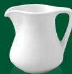
E - 040 CREAMER 4 oz 120 ml