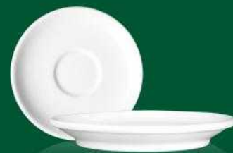
E - 035 SAUCER FOR ESPRESSO AND TALL STACKING ESPRESSO 12 cm / 4.75"