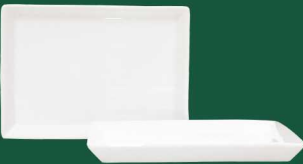
RECT. FLAT TRAY F44