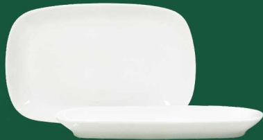
RECT. COUP PLATE F58