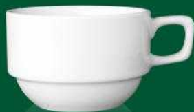
E - 030 STACKING CUP 7 oz 200 ml