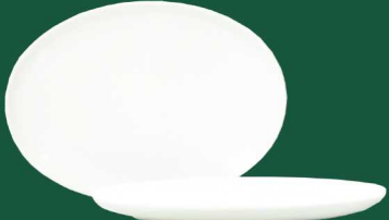
OVAL PLATTER F28