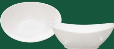
OVAL BOWL F42