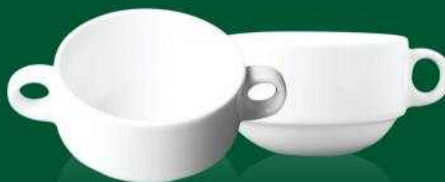
E - 701 SOUP CUP 9.5 oz / 280 ml