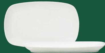
RECT. COUP PLATE F60