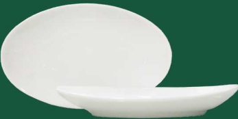
OVAL COUPE PLATTER F46