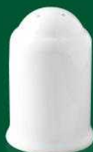
E - 301 SALT SHAKER 8 cm / 3.2"