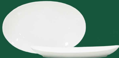
OVAL COUPE PLATTER F48