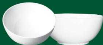
E - 804 NOODLE BOWL 15 cm / 6"