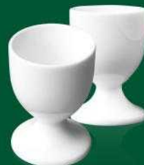
E - 303 EGG CUP STAND 6.7 cm / 2.5"