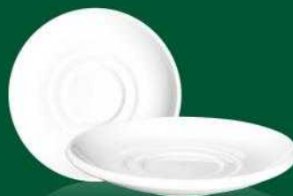
E - 034 SAUCER FOR STACKING AND TALL STACKING CUPS 8 oz 260 ml