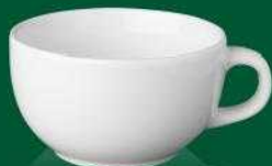
E - 654 CAPPUCINO CUP 12 oz 350 ml