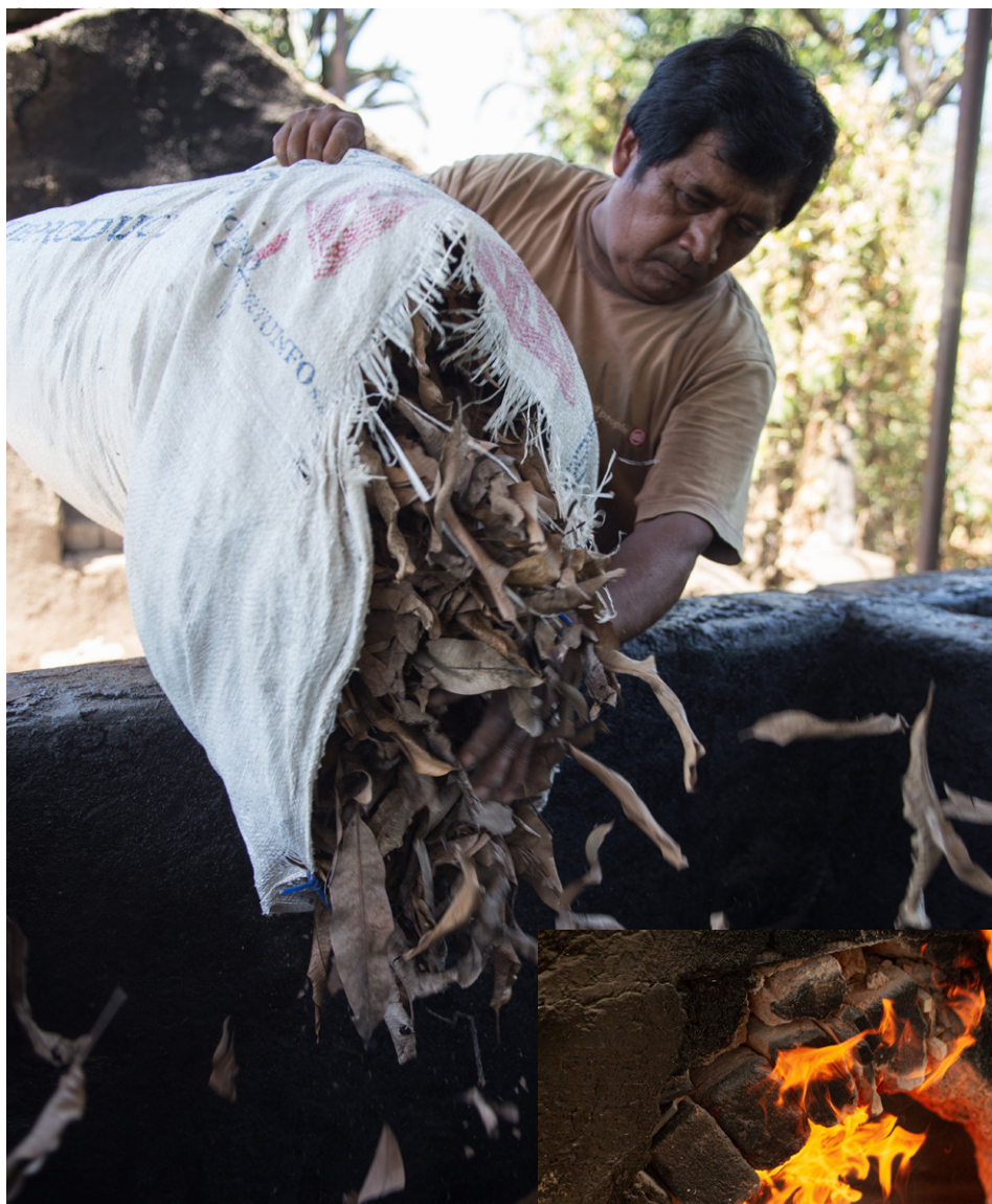
Using mango leaves as fuel...