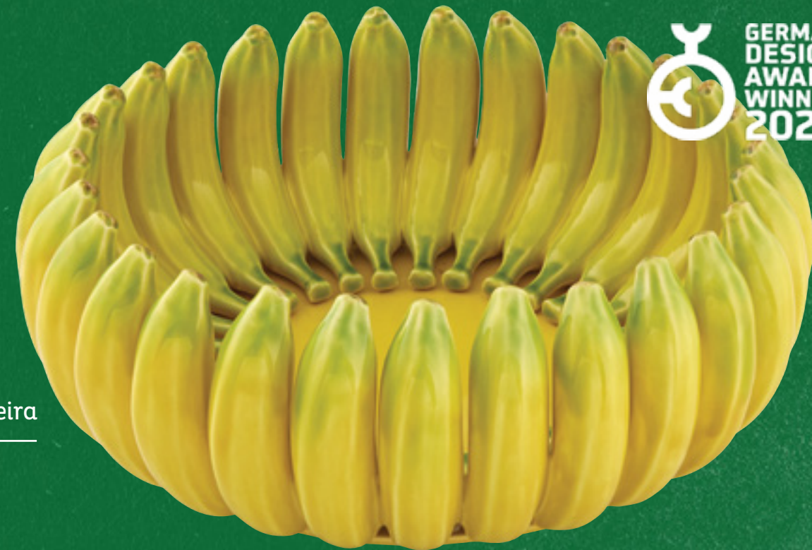
Banana da Madeira