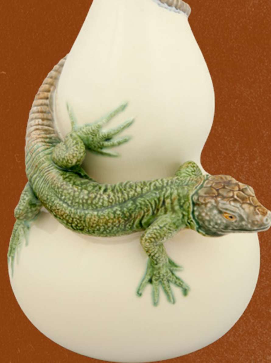
Calabash with Lizard