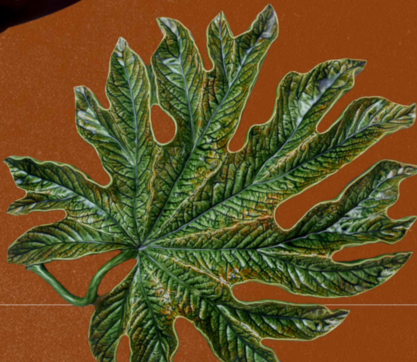
Chestnut Tree Leaf