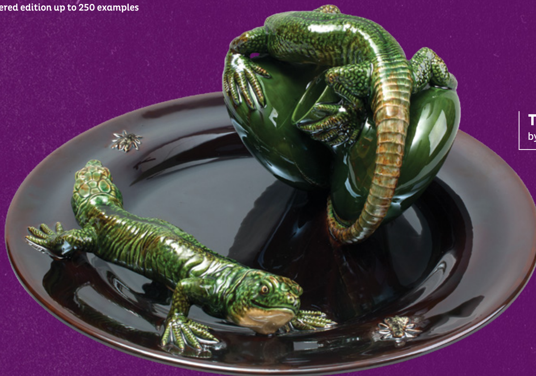
TRANSBORDÁ-LO by Tunga