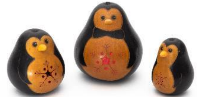
● HUANCAYO Gourd