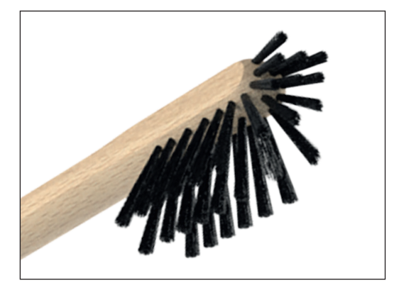
well thought-out bristle cut for optimal cleaning in hard-to-reach places