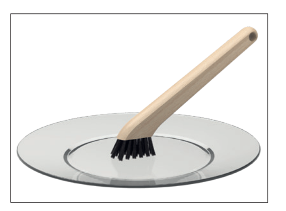
lies comfortably in the hand thanks to its ergonomic design