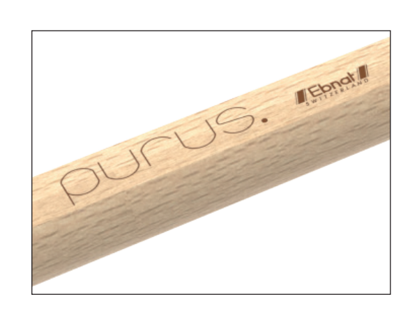
branding completely without printing ink thanks to modern laser technology