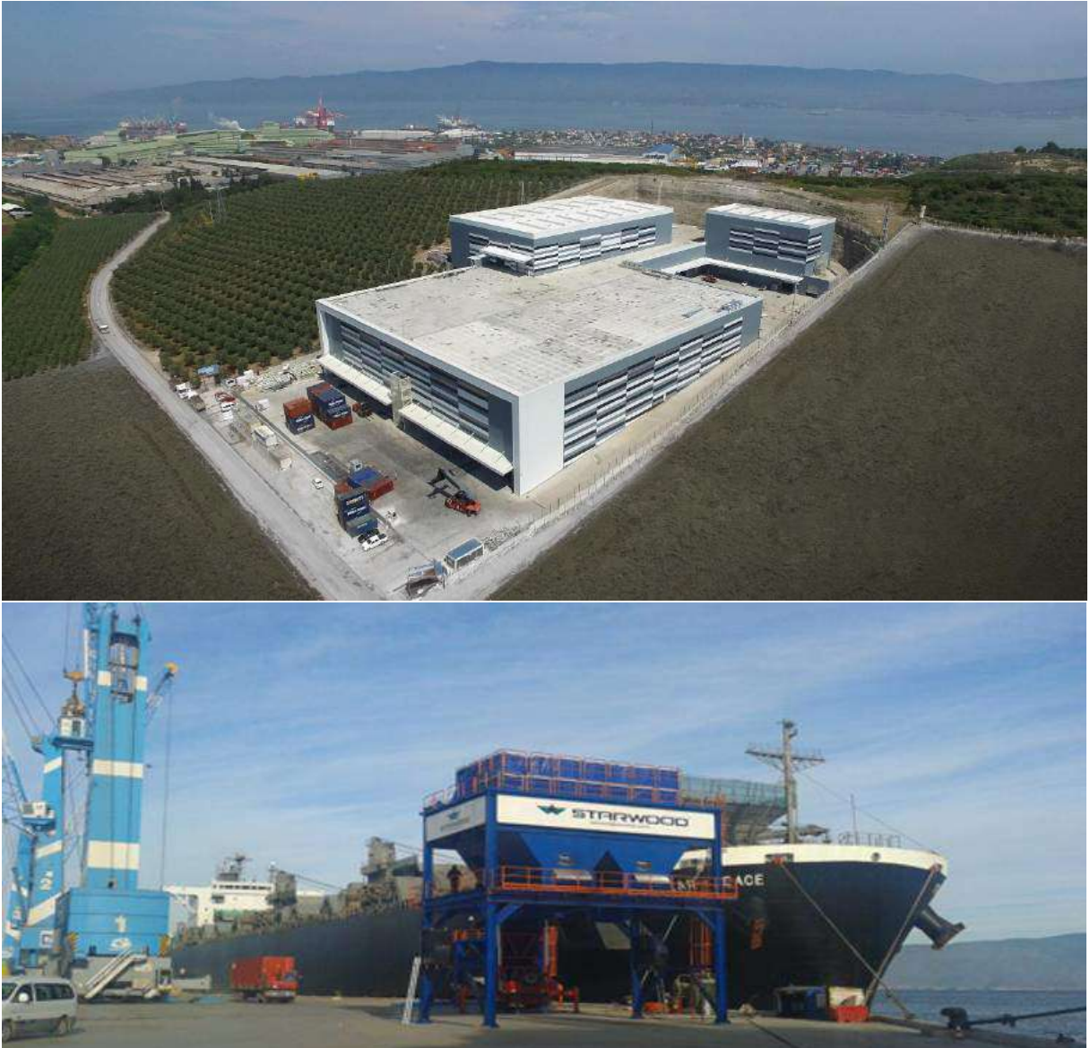
RODA PORT Roda Liman Depolama ve Lojistik İşletmeleri A.Ş