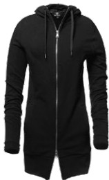
FLEECE ZIPPER JACKET