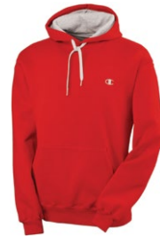
FLEECE PULLOVER HOODED JACKETS