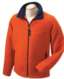
POLAR FLEECE JACKETS