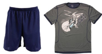
100% POLY MESH T-SHIRTS & SHORTS