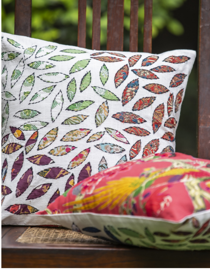
scattered leaves 40x40 16x16"