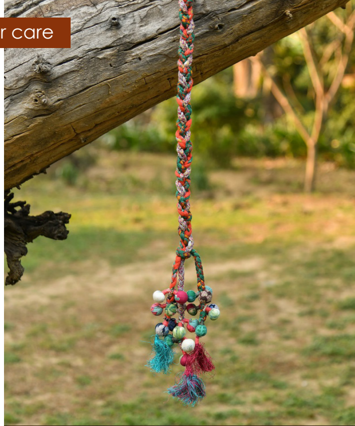
parandi - braid insert