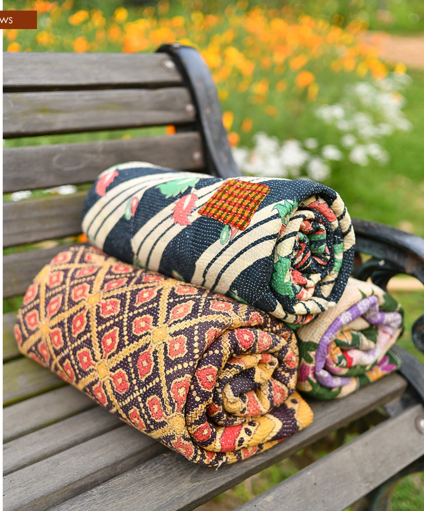
gudri throw vintage cotton 150x225 60x90"

Gudri stitching, also referred to as kantha stitching, The quilts can be made from a variety of materials layered together, ranging from silk fabric, or soft cotton, which is all stitched together with a very intricate handiwork of putting thousands of tiny and very delicate stitches from kantha, to create the ultimate one-of-a-kind masterpiece. These quilts usually support different and intricate pattern work on both sides, and can just be reversed to bring out entirely different patterns and design on the fabric!