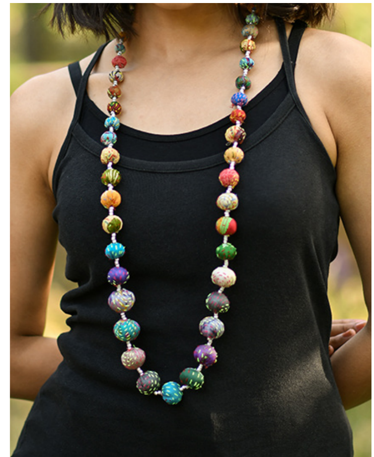
gudri kantha mala