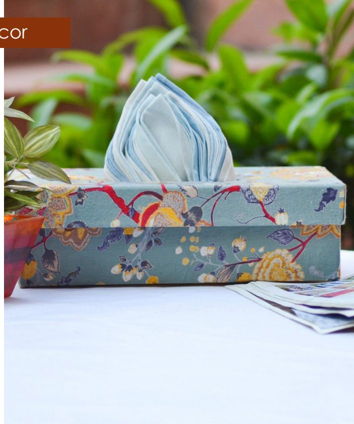
tissue box large