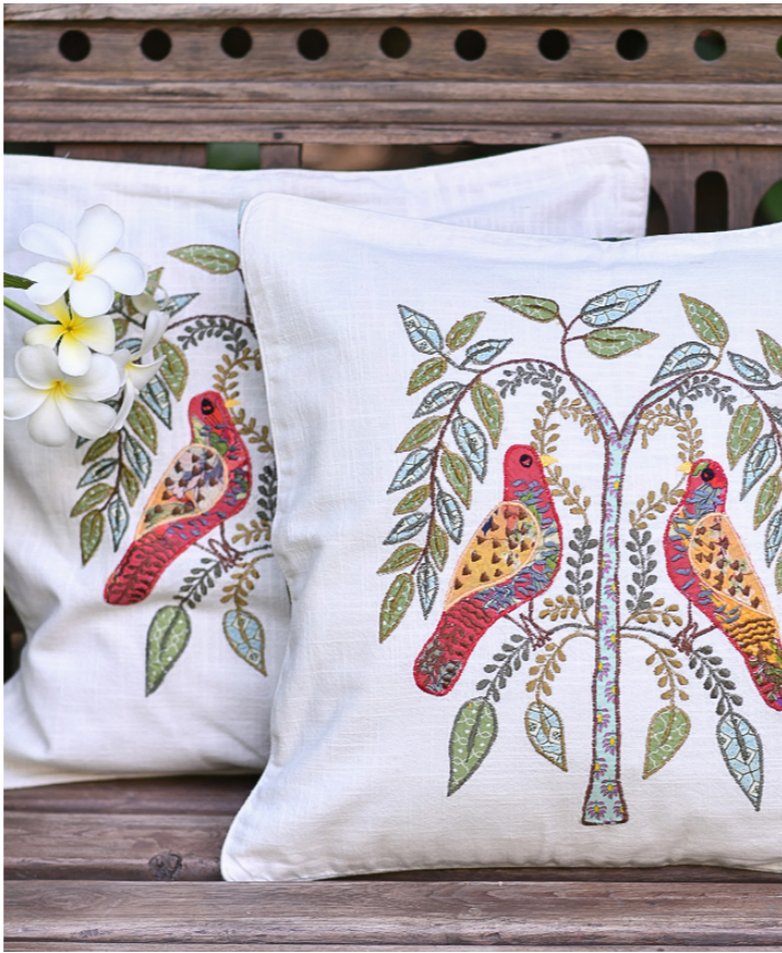
bird tree 45x45 18x18"