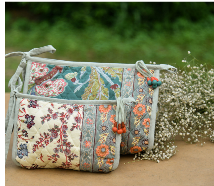
cosmetic bags S, L