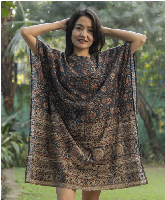
kalamkari blue short kaftan