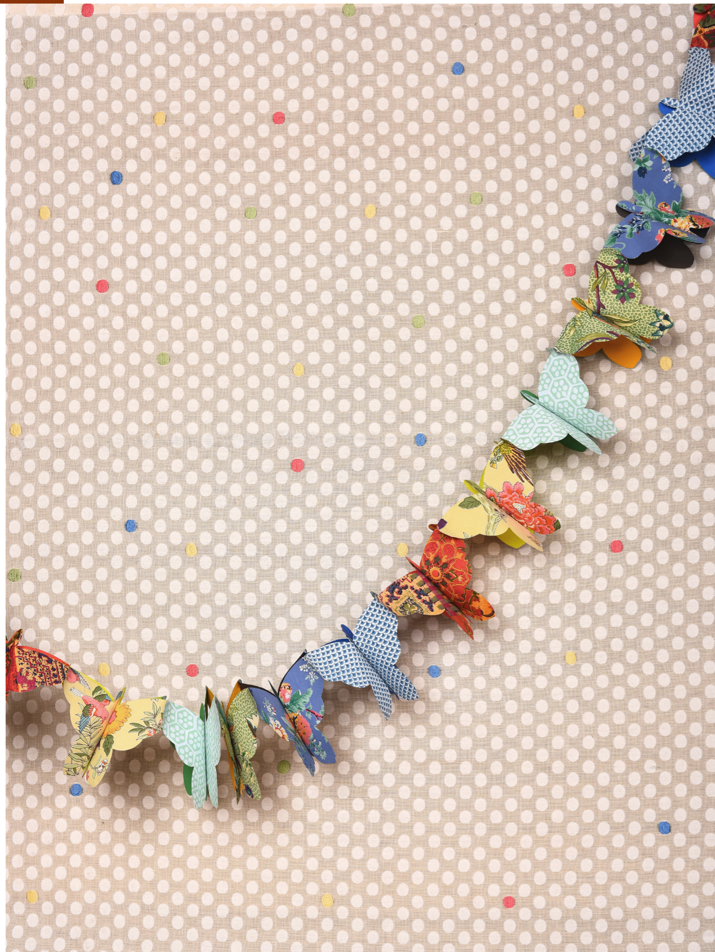
long butterfly hanging