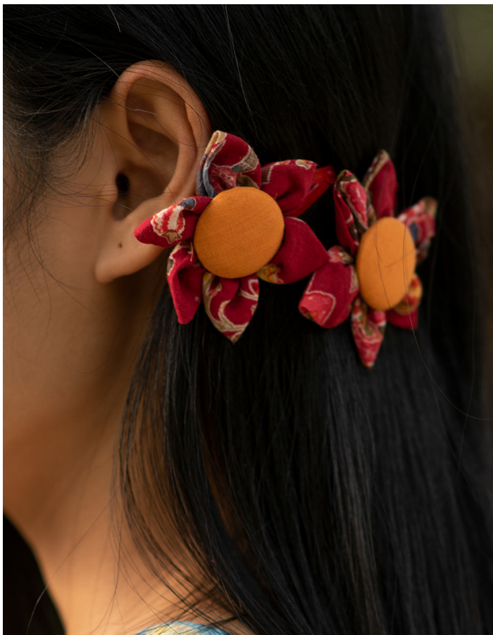
button flower hair clip

Traditionally a girl is supposed to wear flowers on her hair because it brings happiness to the family!