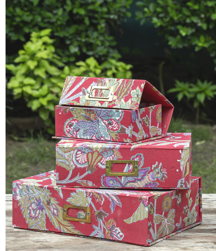
magnetic box set

Add a touch of floral beauty to keepsake gift boxes, tissue boxes and the lights in your room!