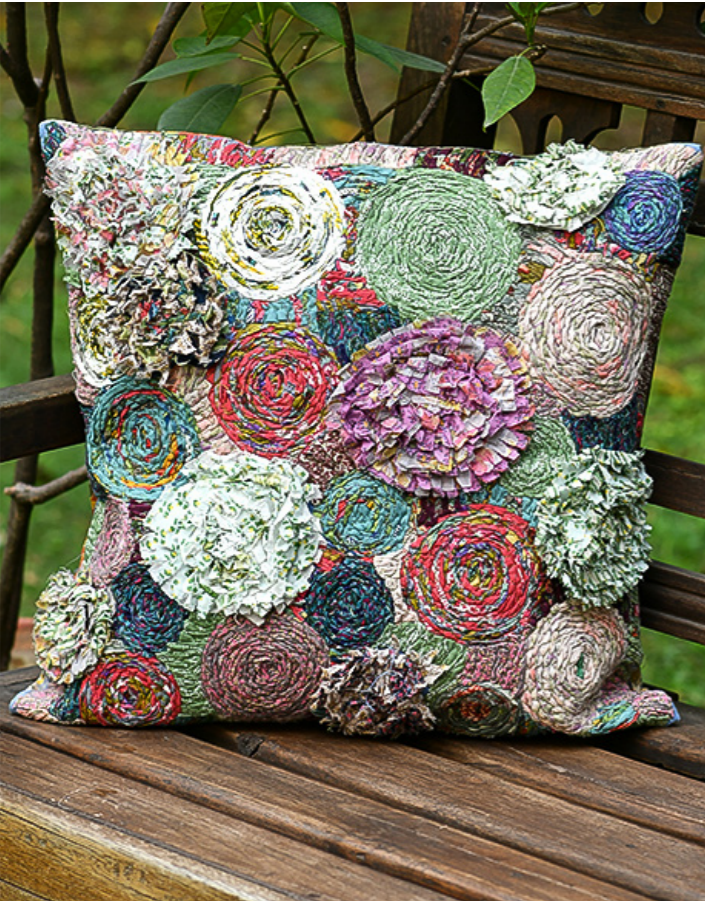
lollipop 40x40 16x16"