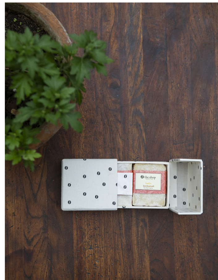
soap gift box set