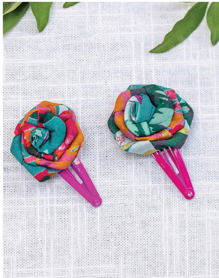
rose hair clip