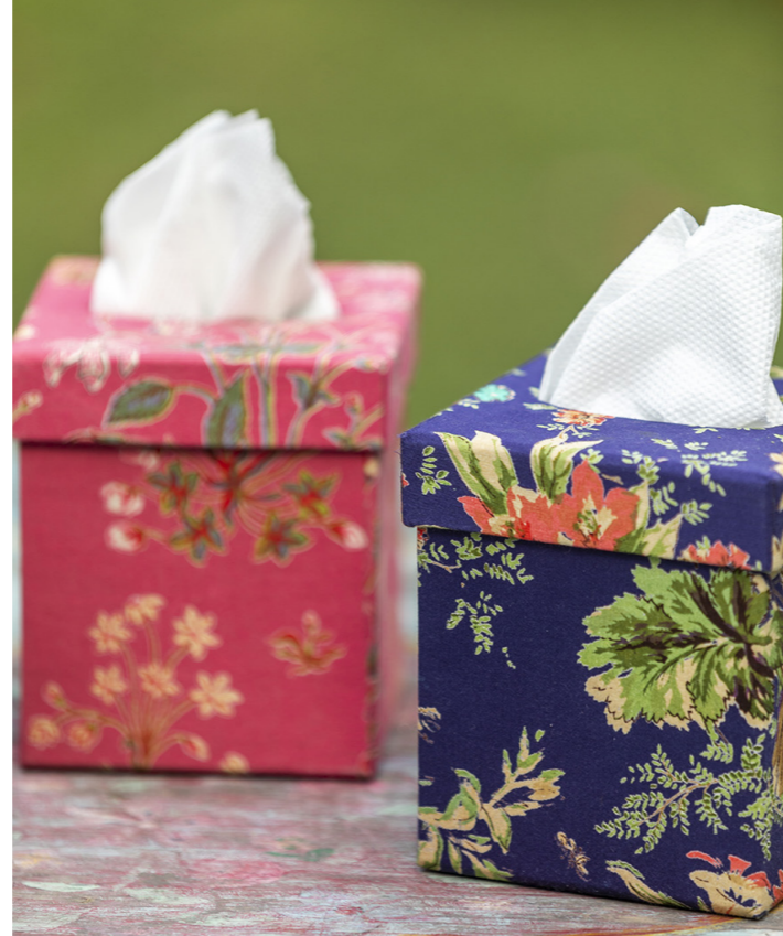
tissue box small