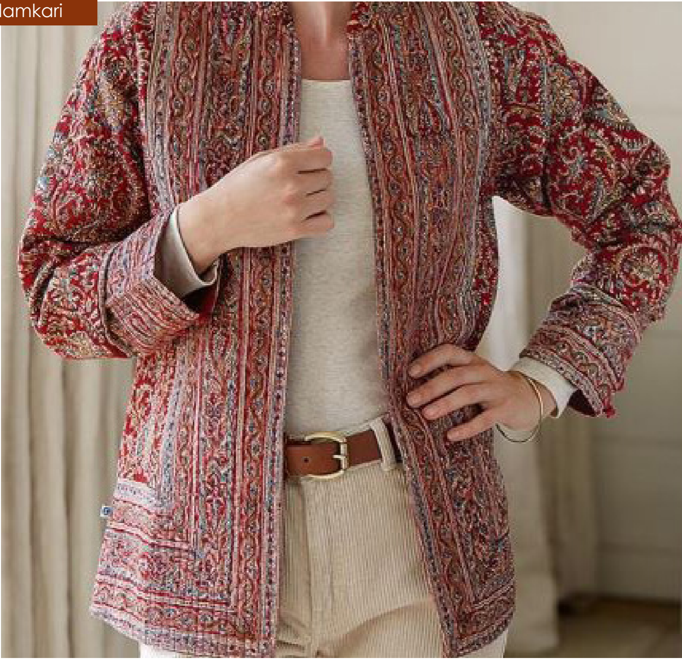
kalamkari red easy fit reversible jacket