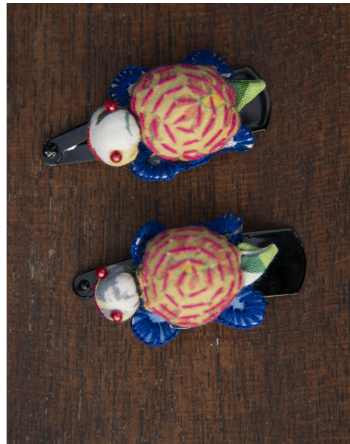
turtle hair clip