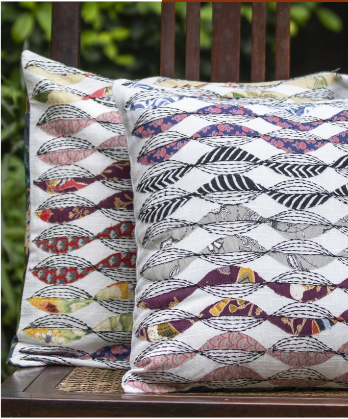
zig zag leaf 40x40 16x16"

Each cushion cover has been carefully handcrafted and embroidered with motifs to create unique surface textures using fabric off cuts. Spruce up your coziest corners for a cause with our handmade vibrant cushion covers.