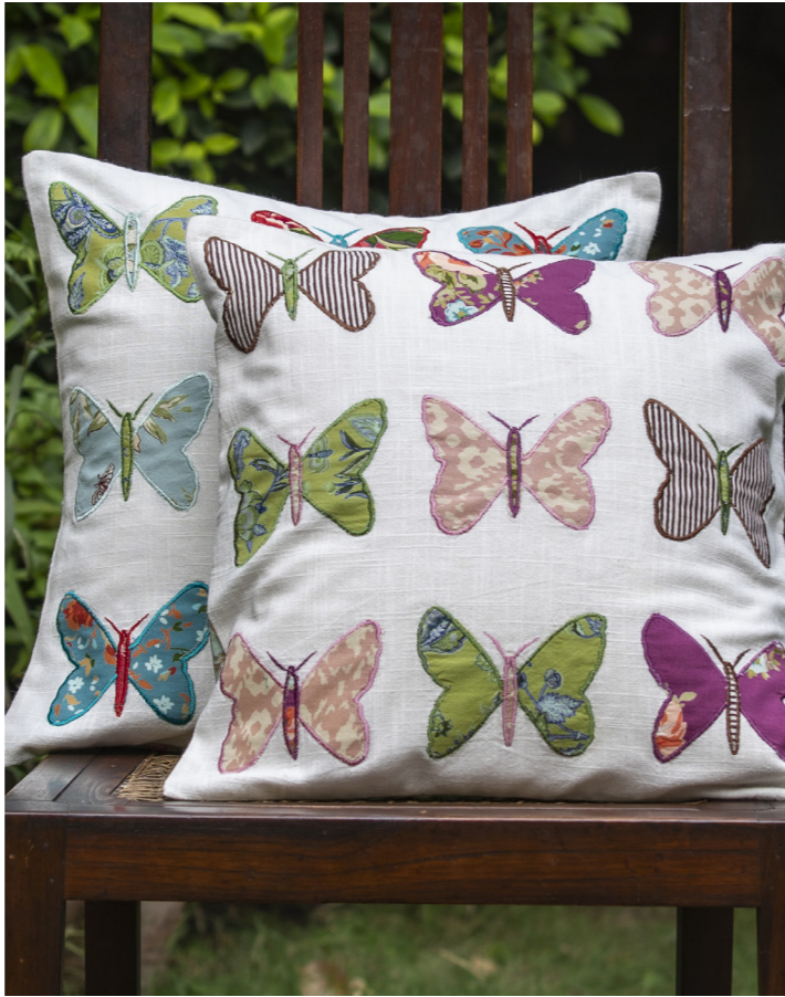
butterfly 40x40 16x16"