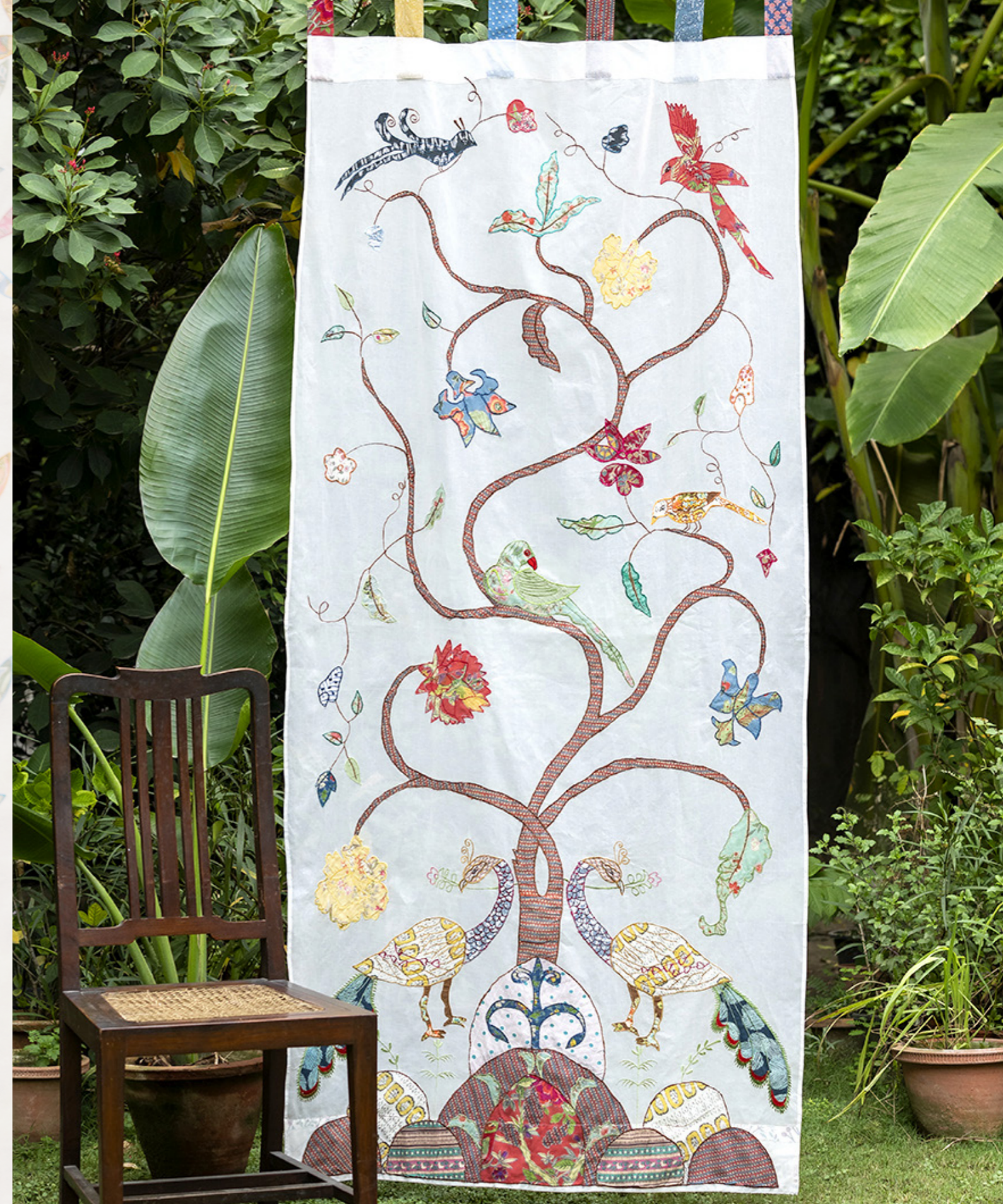
tree of life applique