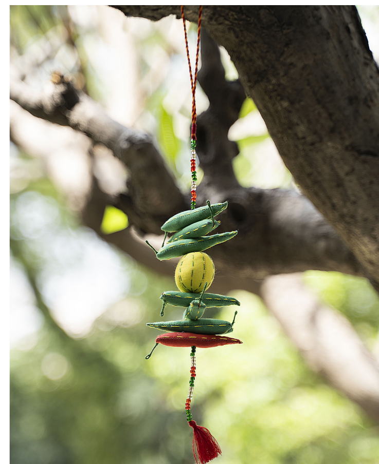
chilli lemon hanging