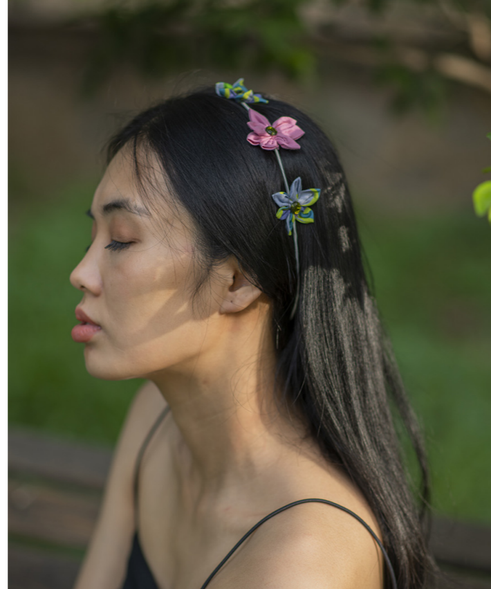
3 flower hairband