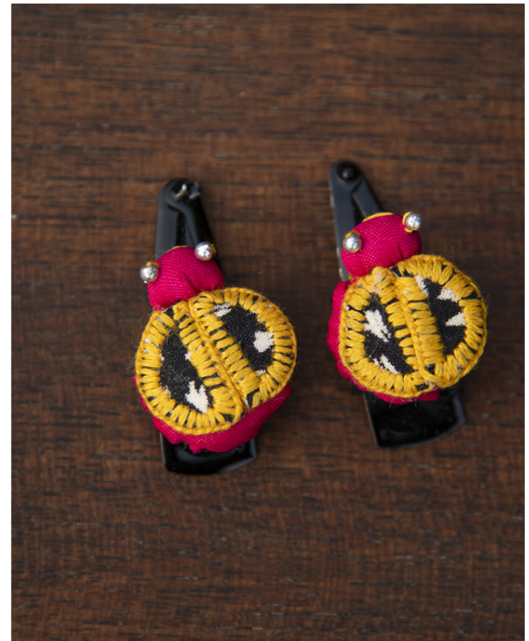
butterfly hair clip