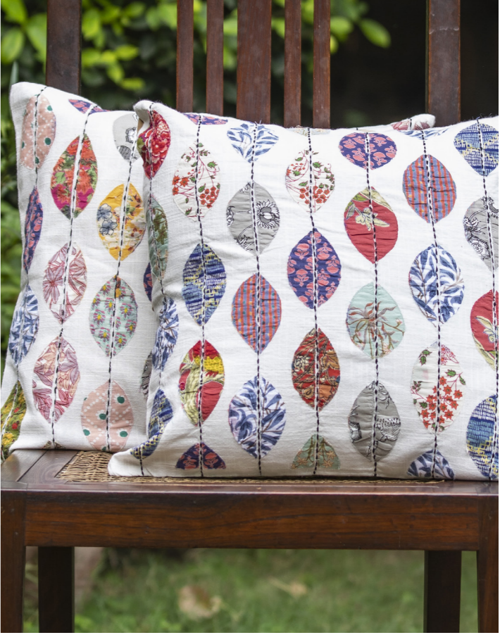
leaf drop 40x40 16x16"