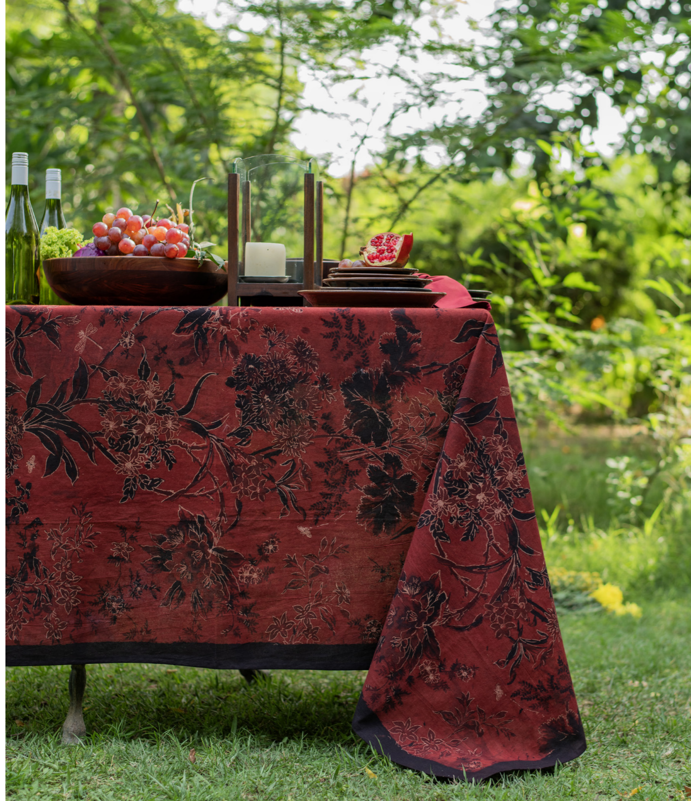
table cloth 150x225 60x90" napkin set/6 43x43 17x17" cushion cover 40x40 16x16"