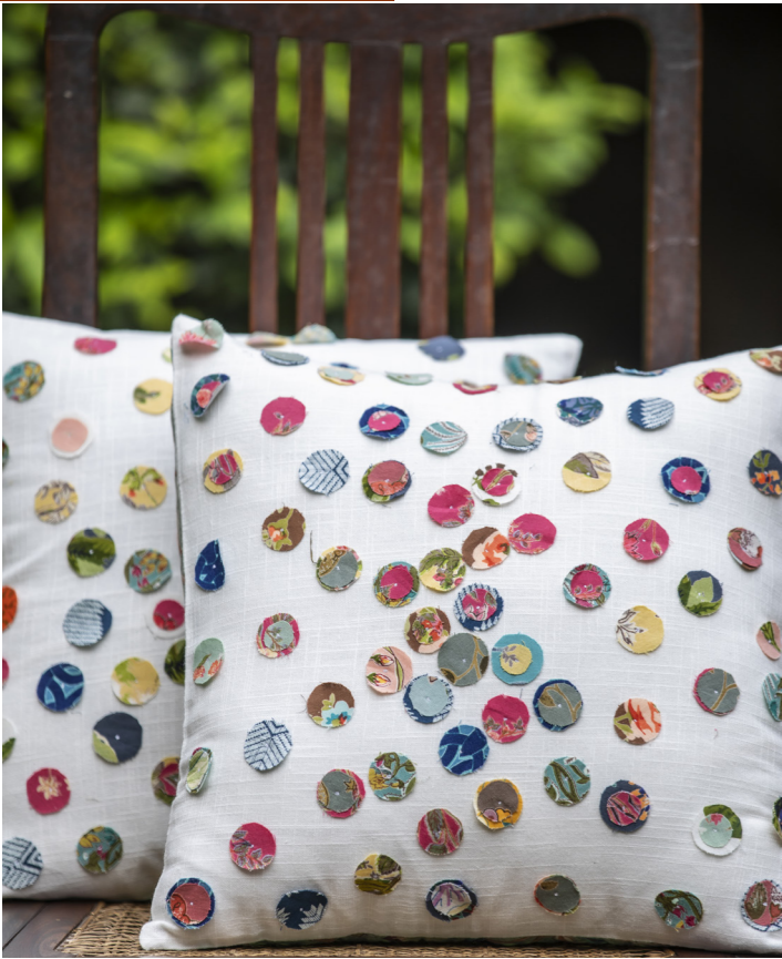
circles 40x40 16x16"