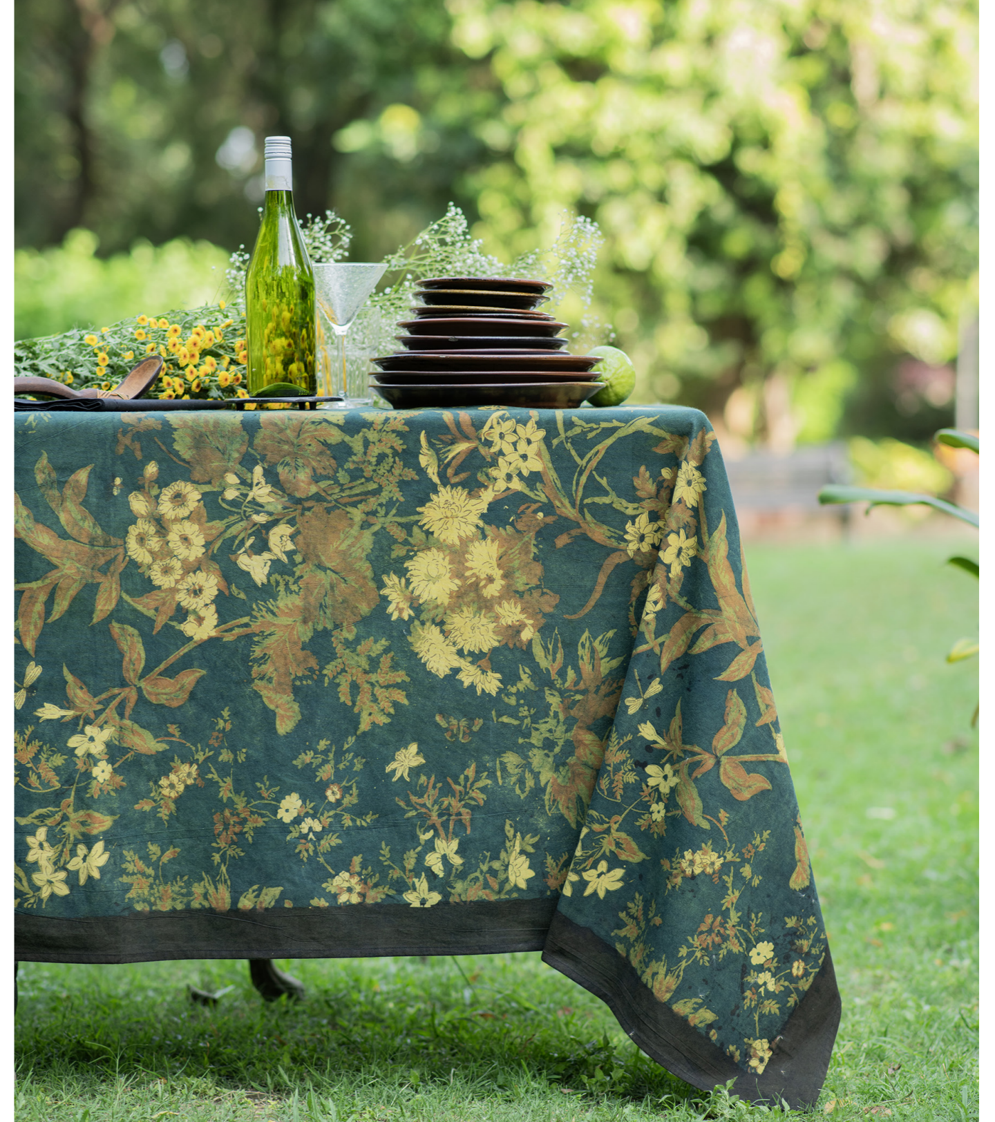
table cloth 150x225 60x90" napkin set/6 43x43 17x17" cushion cover 40x40 16x16"