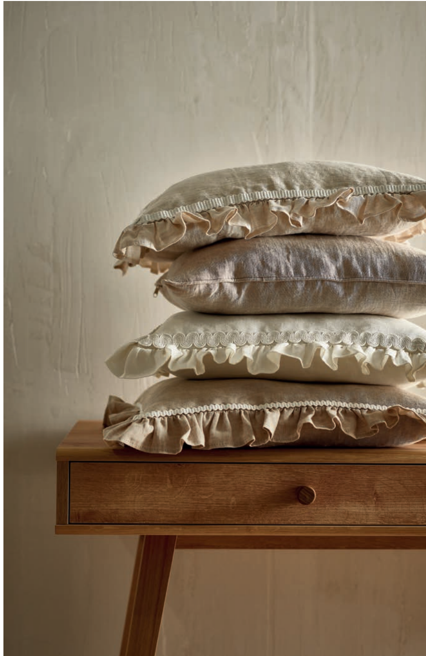
GIMP G.0653 17MM, WAVE BRAID WB.1397, GIMP G.0653 10MM

Many believe that textile trimmings are always colourful, shiny, rich in form and opulent in ornamentation. However, decorations come in all shapes and sizes and can also be more toned-down and modest. This is useful when trying to highlight simple forms designed for everyday use.