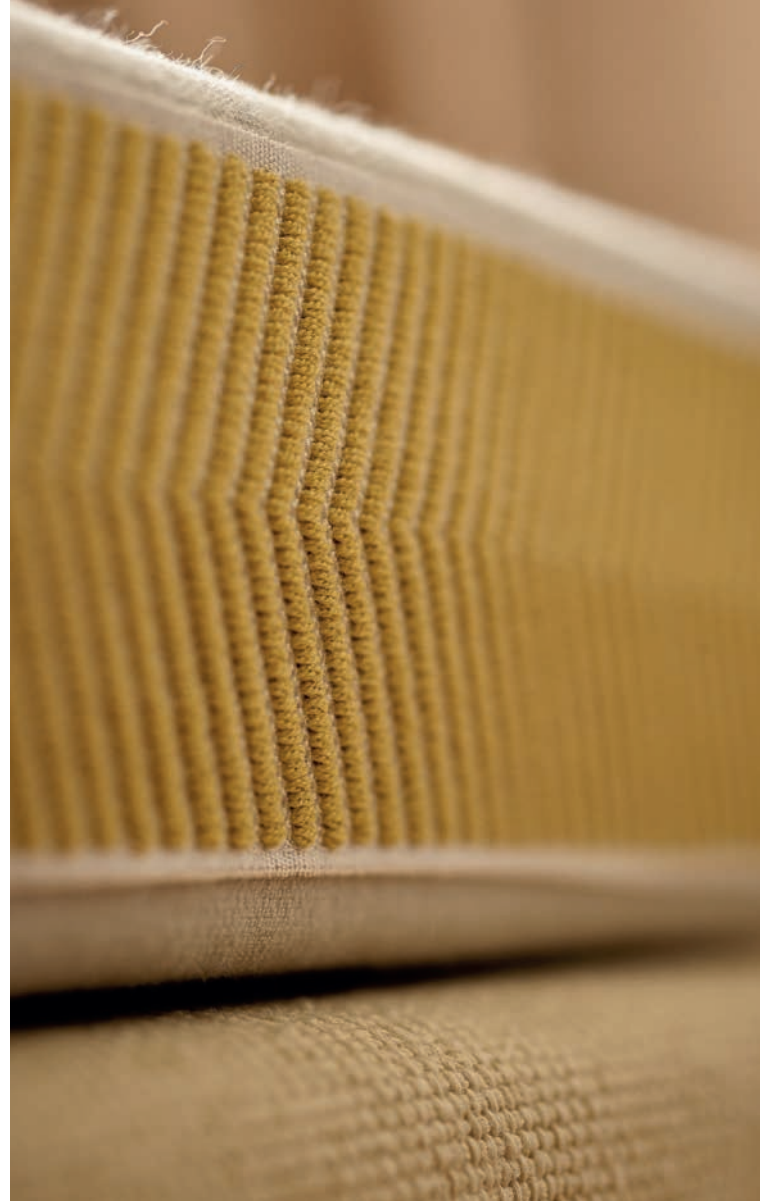
ZIG-ZAG BORDER ZB.0156

Appropriately coordinated fringes of the same colour but with different decorative patterns can form a personalised collection of interior accessories.