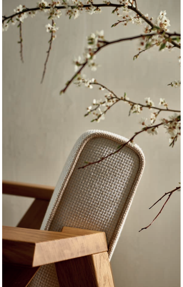
CORD WITH TAPE CT.0087

Fringes and gimps of various shapes and widths can be used in conjunction with tassels to form a coherent, attractive whole, with individual items complimenting each other. Even when all such decorations come in a single colour, they offer an entire array of different subtle finishes for accessories, window curtains and upholstered furniture.