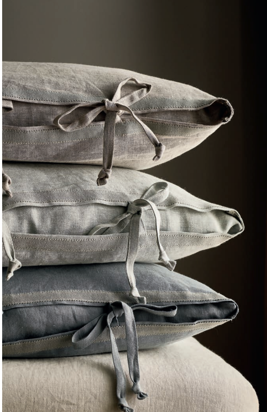
BRAID B.1064 17MM

The wide range of colours available in this collection allows matching trimmings and fabrics perfectly to create an eye-pleasing, balanced, harmonious whole.