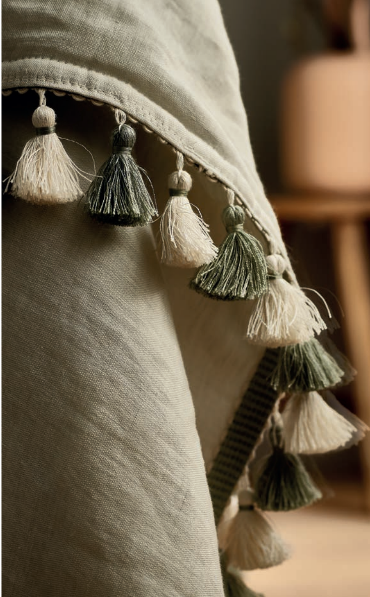
TASSEL FRINGE TF.1400