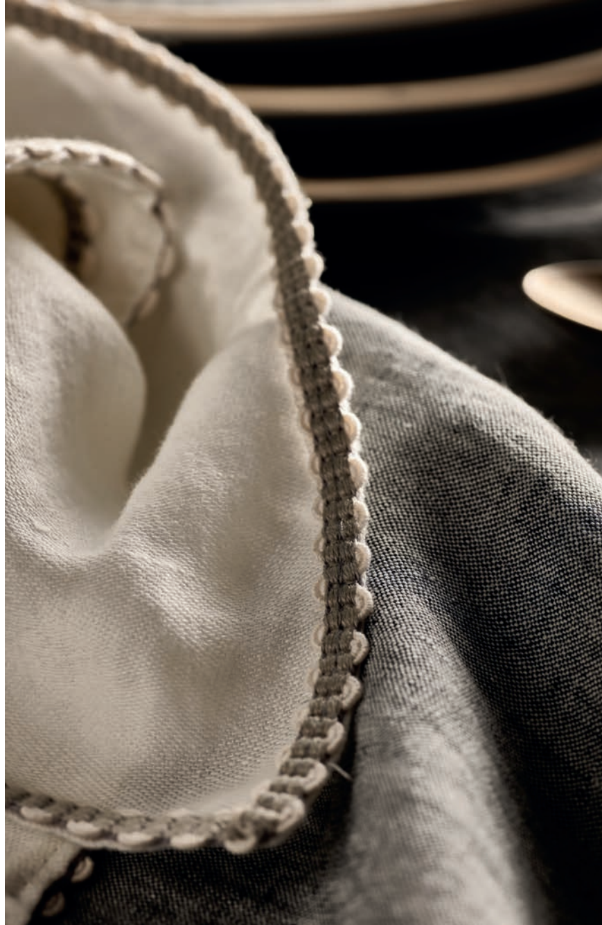
GIMP G.0653 10MM

The rules for combining different elements of identical colours can be applied e.g. to table textiles. A table cloth, a table runner and napkins will form a cohesive collection when used with a colourful item binding them together.