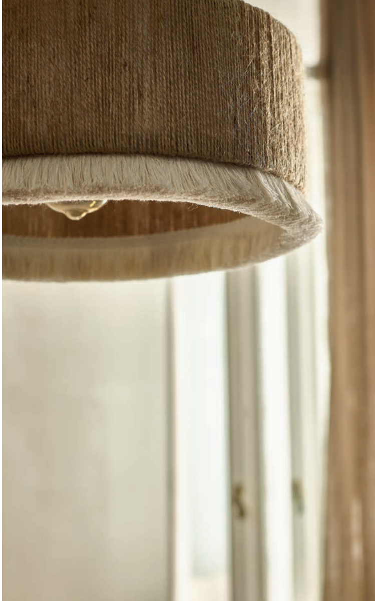
BRUSH FRINGE BF.0774