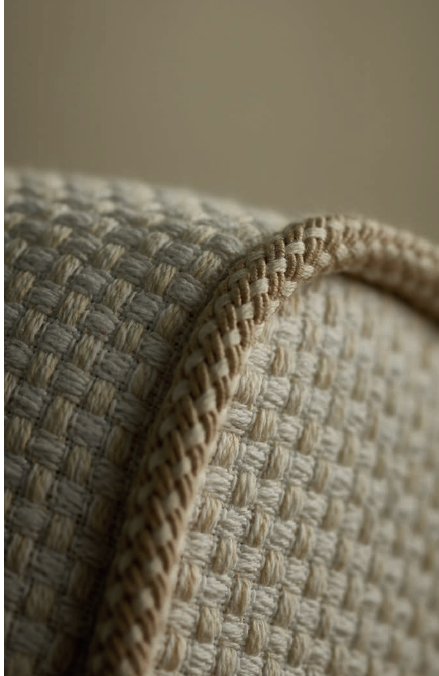
CORD WITH TAPE CT.0087

The use of cords with tapes is a perfect solution when you need to enhance the shape of a piece of upholstered furniture. They produce soft, clear lines that highlight the textile form.