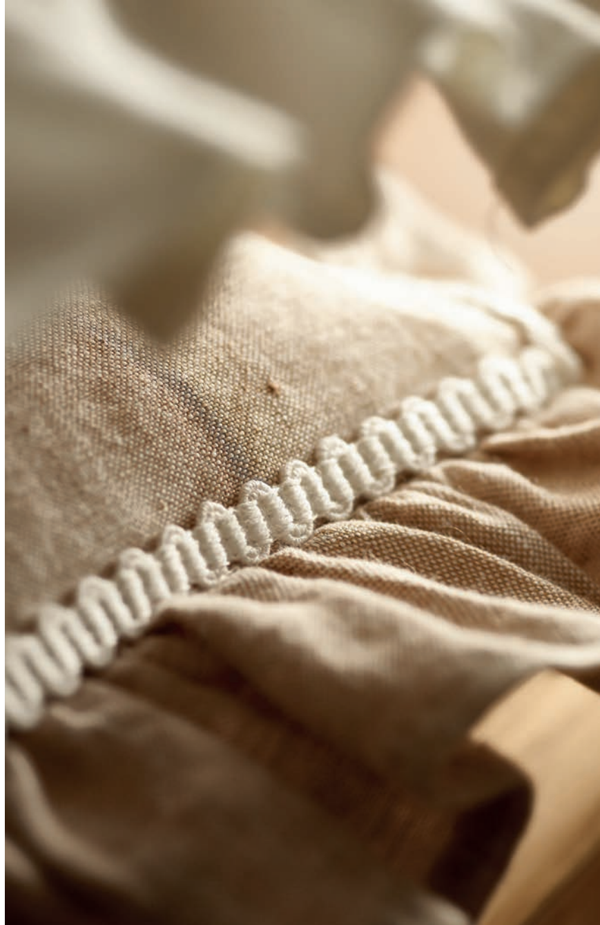
GIMP G.0653 10MM

All patterns in the Naturals collection are reminiscent of mind calmness, gentleness, and bliss characteristic of places ideal for rest and relaxation. Depending on how many patterns you use, the end result can produce associations with an idyllic provincial home or an urban villa lit up by midday sunlight.