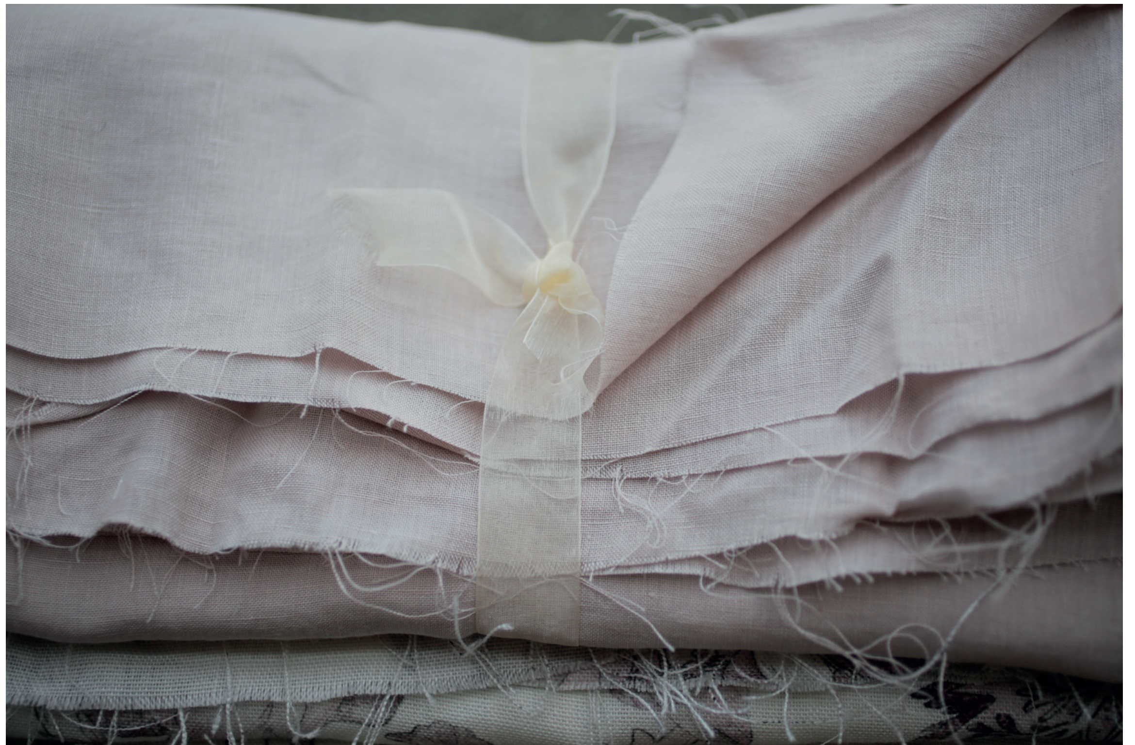
HEDONE Rose, HYBRIS Rosa