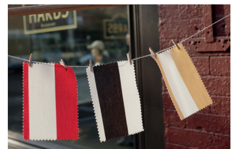
HOLIDAY Fire, Onyx, Sunshine