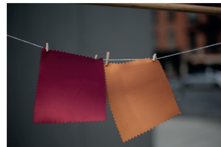
ANTON Terracotta and Sorbet