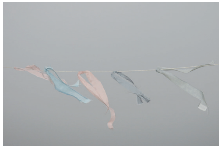
HEDONE Rosa and Blue

Fabrics harmonise and resonate with light, just like with the air that surrounds them and makes them move. Subtle waves of smooth linen and cotton, natural colours and thick weaves gain a new look with every change of light. From dusk till dawn, every fabric changes incessantly, following the cycle of nature.