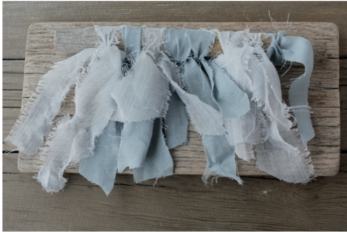
HEDONE Blue and Rose, PURO Dove