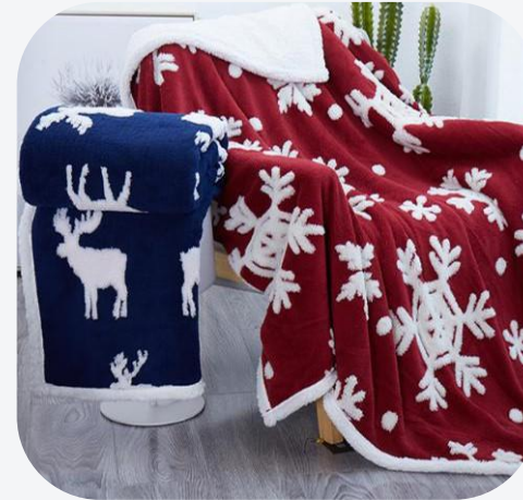
Jacquard Flannel Blanket