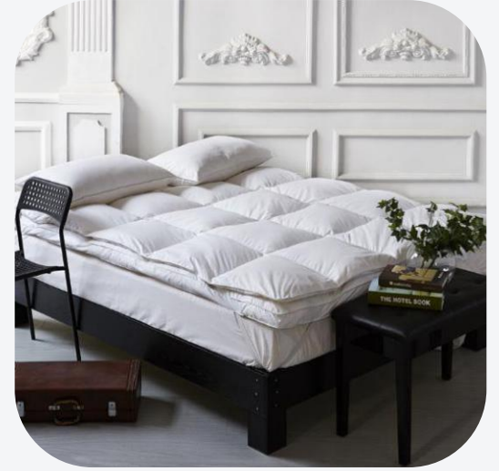
Down & Feather Filled Mattress Topper