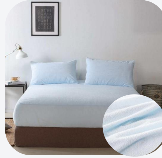
Terry Mattress Protector