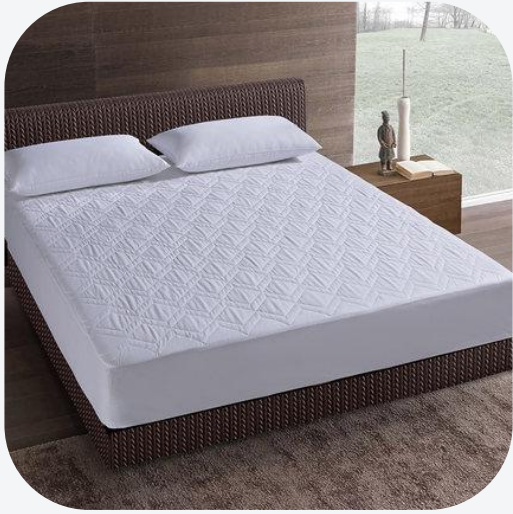
Microfiber Mattress Protector