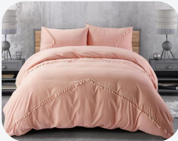
Cotton Fabric Bedding Set