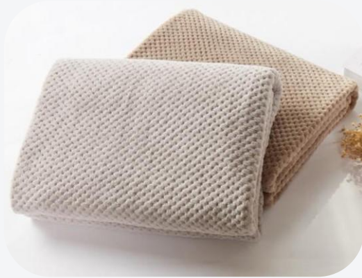
Waffle Flannel Fleece Blanket