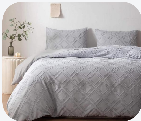
Microfiber Fabric Bedding Set