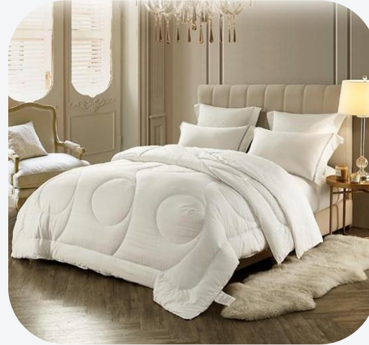
Four Season Quilt