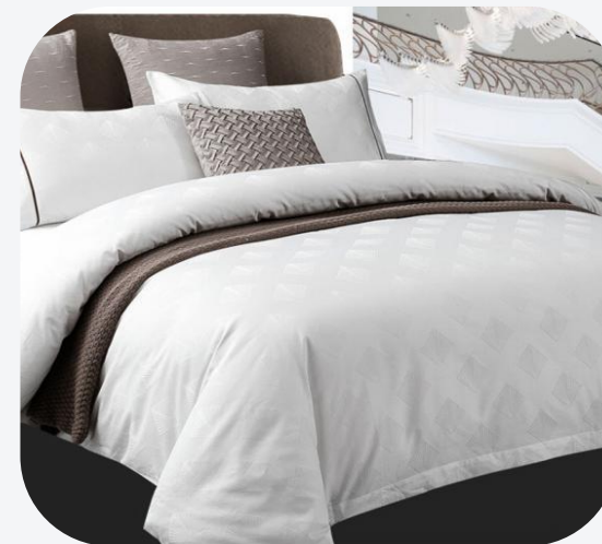
Satin Bedding Set