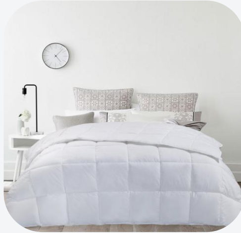
Winter / Summer Quilt