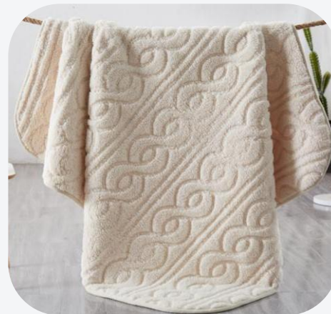
Sherpa Fleece Blanket