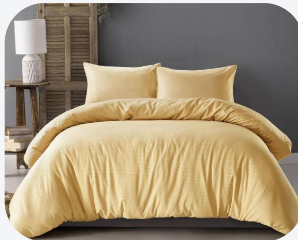
Bamboo Fabric Bedding Set