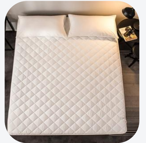
Hotel Mattress Pad