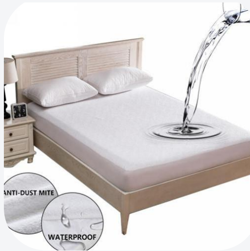
Waterproof Mattress Protector