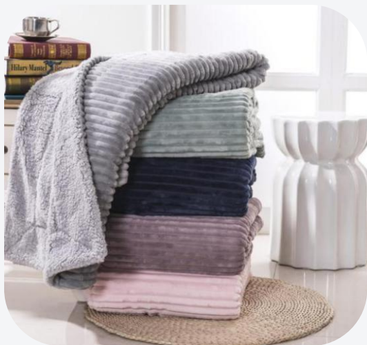
Flannel With Sherpa Blanket