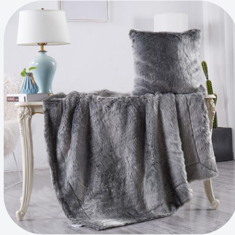
Faux Fur Blanket