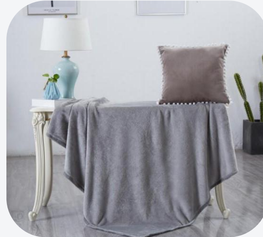
Solid Flannel Blanket