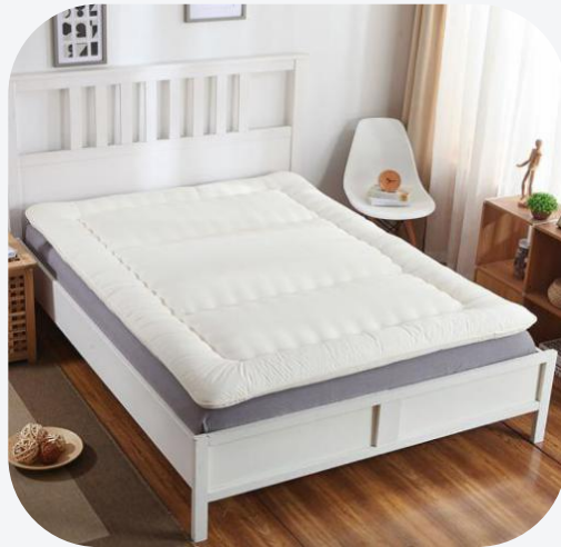
Wool Mattress Pad