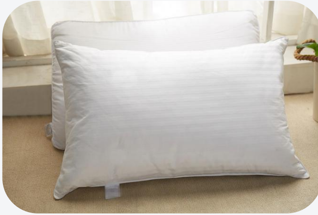
Cotton Fabric Pillow