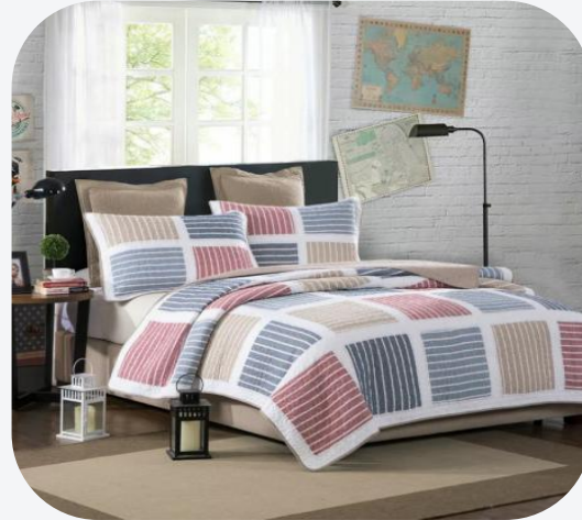
Cotton Fabric Bedspread