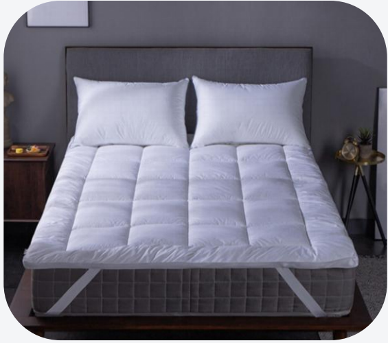
Polyester Filled Mattress Pad