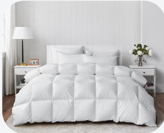
Feather and Down Duvet