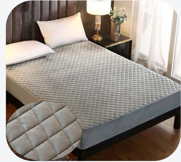
Fleece Mattress Protector