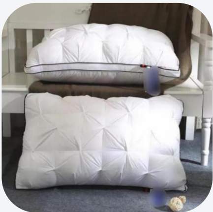
Down and Feather Pillow