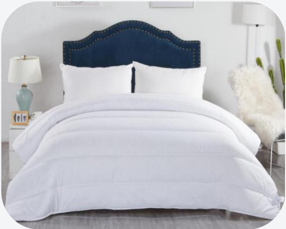
Carbon Anti-Stress Duvet