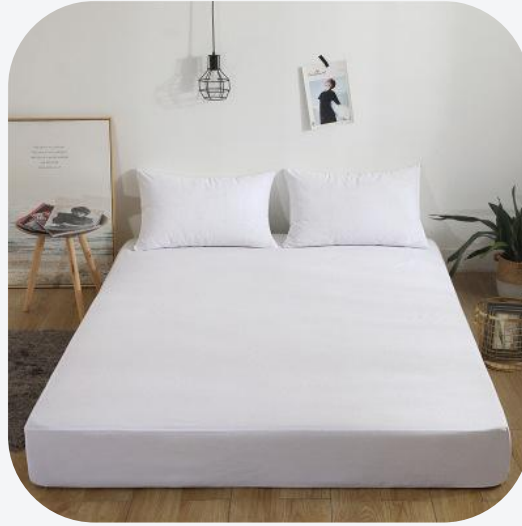
Cotton Mattress Protector