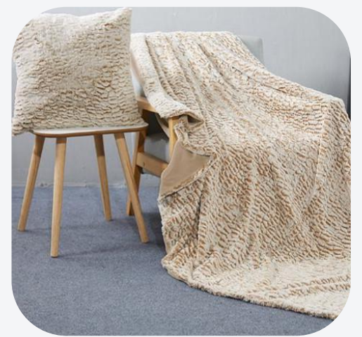
PV Fleece Blanket