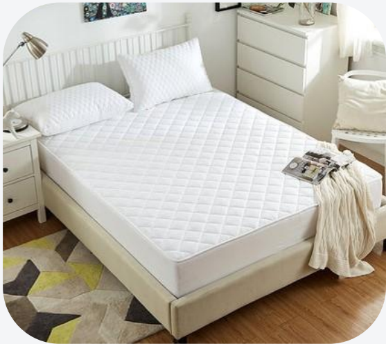
Quilted Mattress Protector