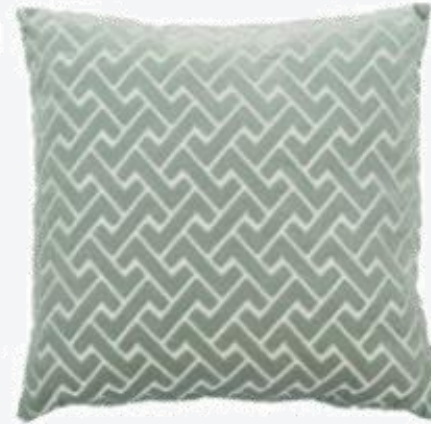
Jacquard cushion Cushion