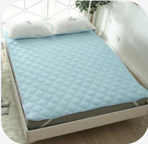
Cooling Mattress Pad