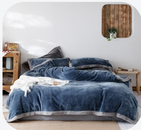
Fleece Bedding Set