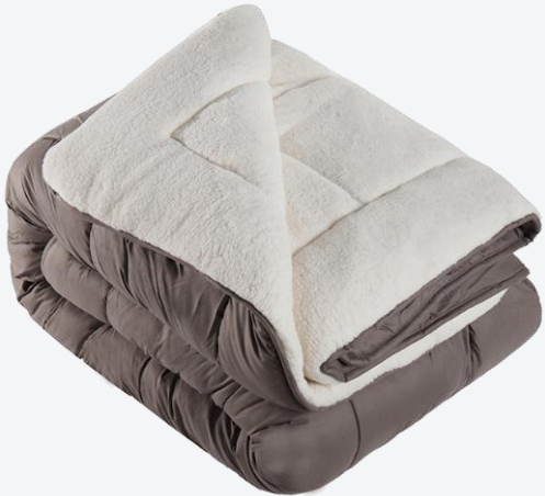
Sherpa Fleece Quilt