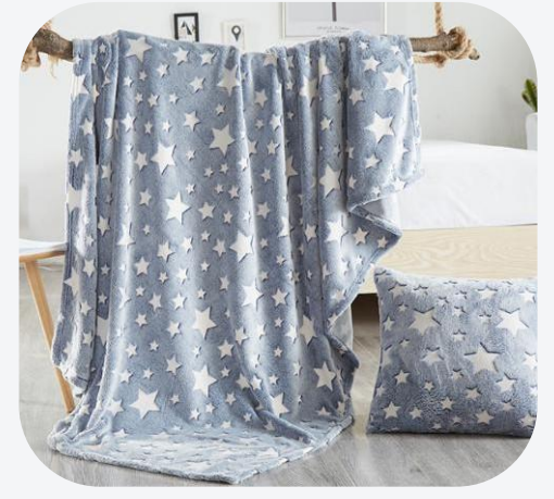
Glow In The Dark Blanket