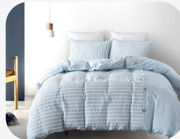
Hotel Bedding Set