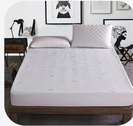
Cooling Mattress Protector