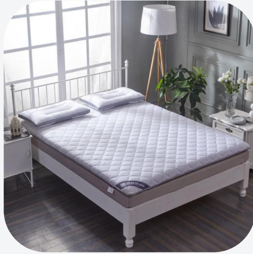
Quilted Fitted Mattress Pad