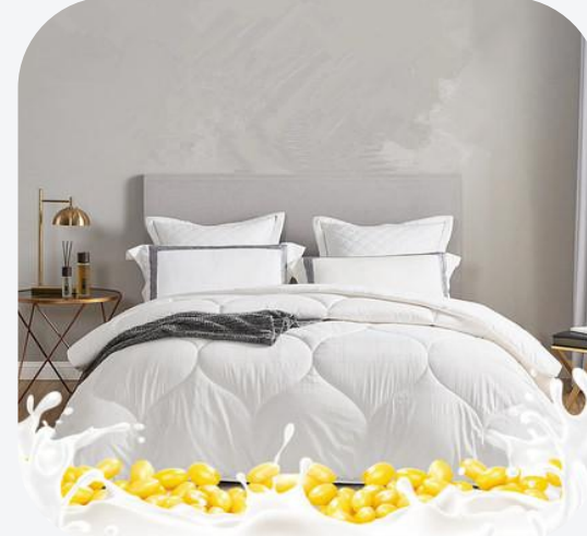
Soybean Fiber Duvet