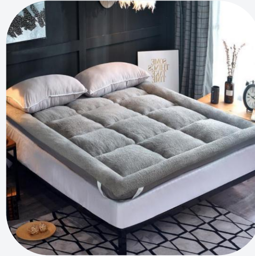
Fleece Mattress Pad