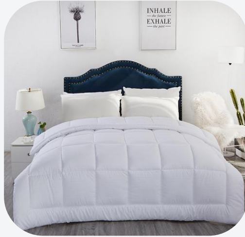
Embossed / Seersucker Quilt