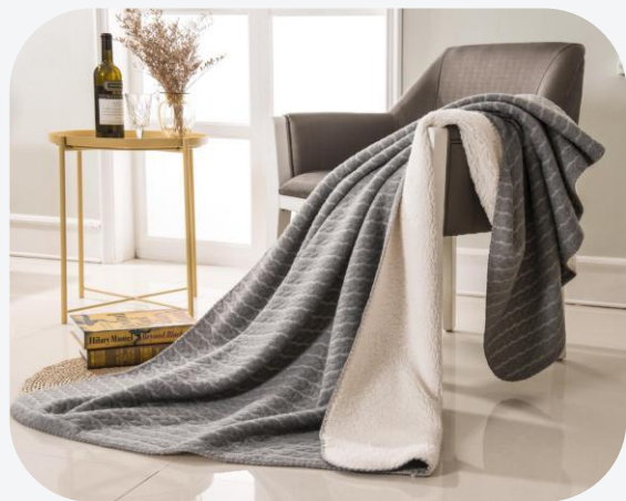
Air Fleece Blanket