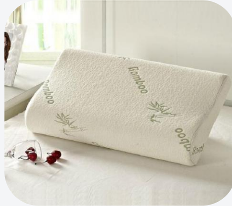
Memory Foam Pillow