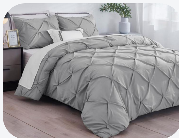
Artist Bedding Set