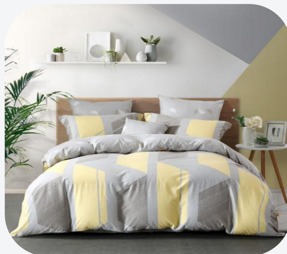
Printed Bedding Set