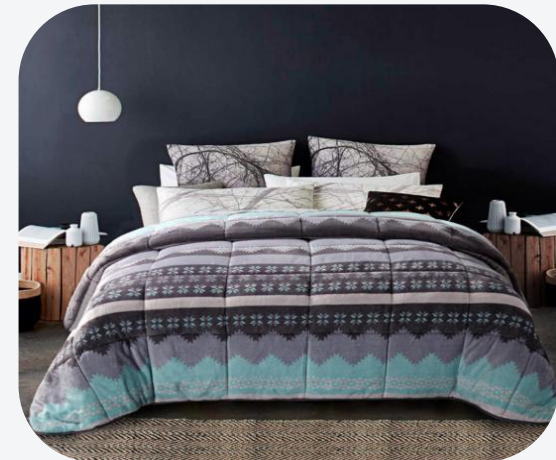
Flannel Fleece Comforter