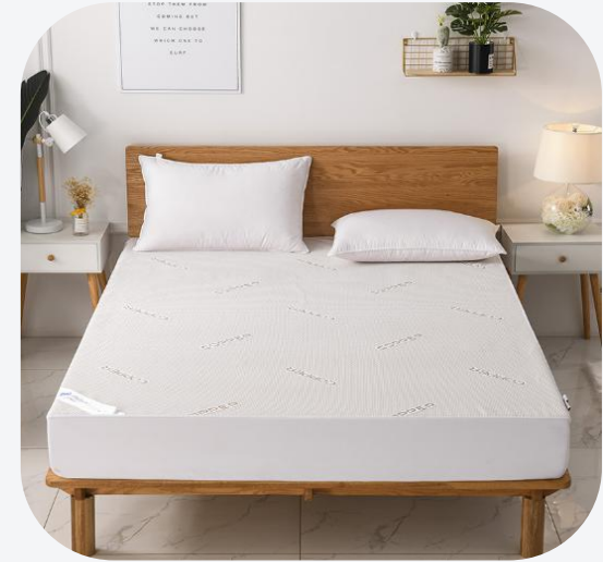
Copper Mattress Protector