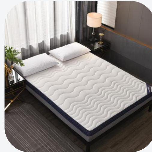
Memory Foam Mattress Pad