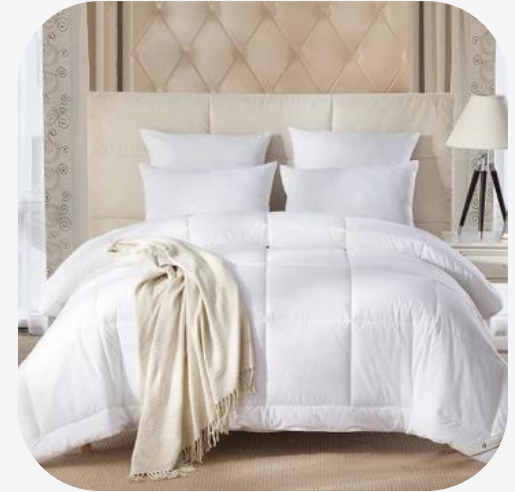
Down Alternative Duvet