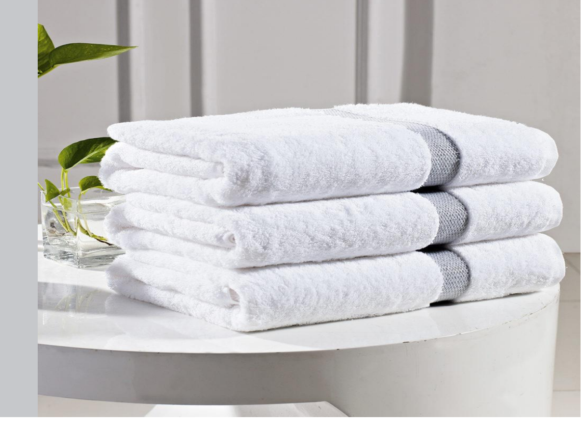
HOSPITALITY · SPA