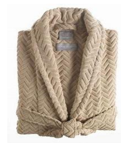
Textured 100 % Cotton – 550 g/m<sup>2</sup>

Exceptional Elegance! 100% pure cotton – classic yarn – 550 g/m²