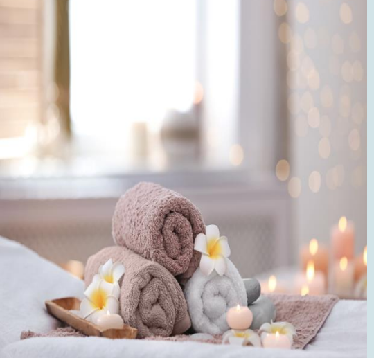
Plot 4-5 Sector 12- D North Karachi Industrial Area