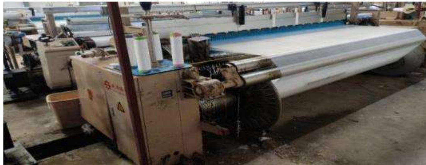
Shuttleless Weaving Machine