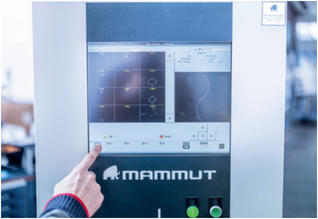
▲ Modern touch control