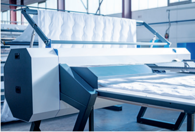
▲ Panel cutter