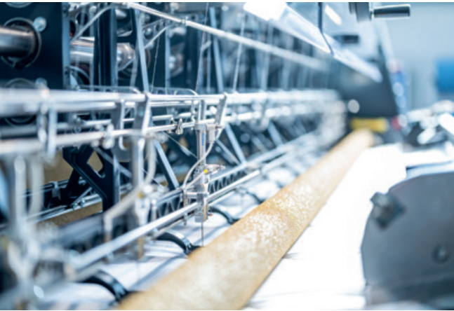
▲ Liftable needles