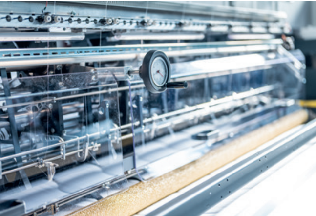
▲ Height adjustable presser feet