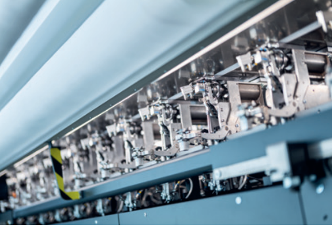
▲ Automatic bobbin changer